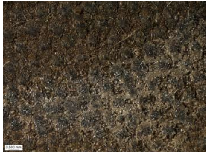
Figure 2. Cotton canvas substrate bearing a thin, crystalline coating.

bead degradation to some degree. These objects included mid-to-late twentieth-century costume, jewelry and ceremonial regalia (Figure 1). Fields of multi-colored opaque and translucent glass beads covered the majority of leather and cotton substrates; jewelry was without substrate.