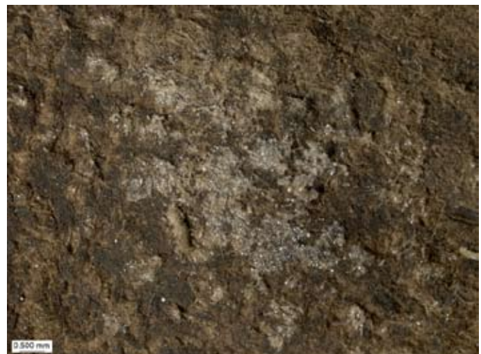
Figure 3. Leather substrate bearing a thin, crystalline coating (Photo: Mel Wachowiak and Maria Fusco, Museum Conservation Institute, Smithsonian Institution).

This paper focuses on analysis of the Ndebele objects that have degrading glass beads, some that appeared to be coated. A greasy coating was found on many pieces of costume, jewelry and ceremonial regalia (e.g., women's pelvic aprons, children's breast-plates, pendants and a ceremonial staff). The coating did not appear to be associated with a leather dressing given that it was found on cotton canvas and cotton knit objects as well as beaded jewelry with no substrate (Figure 2 and Figure 3). This coating was not only found on the substrates but also appeared to have been applied directly to the beads.