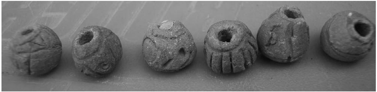
Six pottery beads