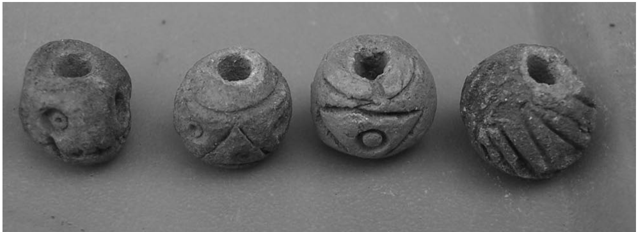
Four pottery beads illustrating possible "faces" (left two beads) and geometric motifs (right two beads)