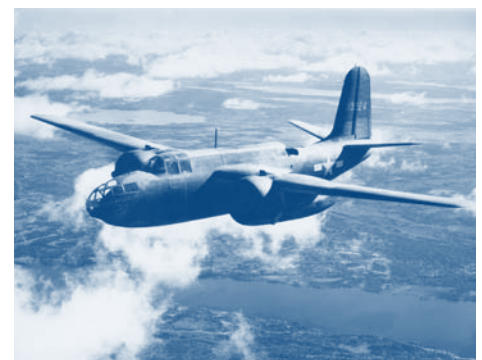
An A-20C in flight over Newfoundland

After strategizing a plan of attack, I decided there was no easy route. I slowly began devising categories for the prints as I began to recognize similarities throughout