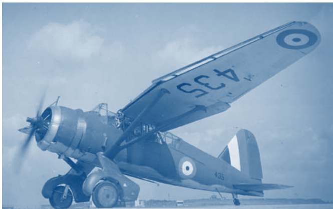
A Lysander on the runway

the front. However, just as many were not accompanied with a description or any indication as to where or when the photograph was taken or what the photograph was of.