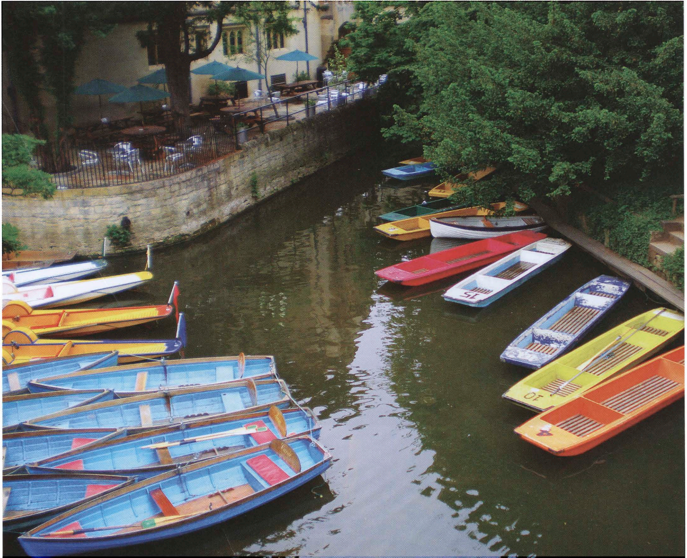
Greg Maslak Punt Station on the Cherwell Oxford, England London Program, Summer 2007