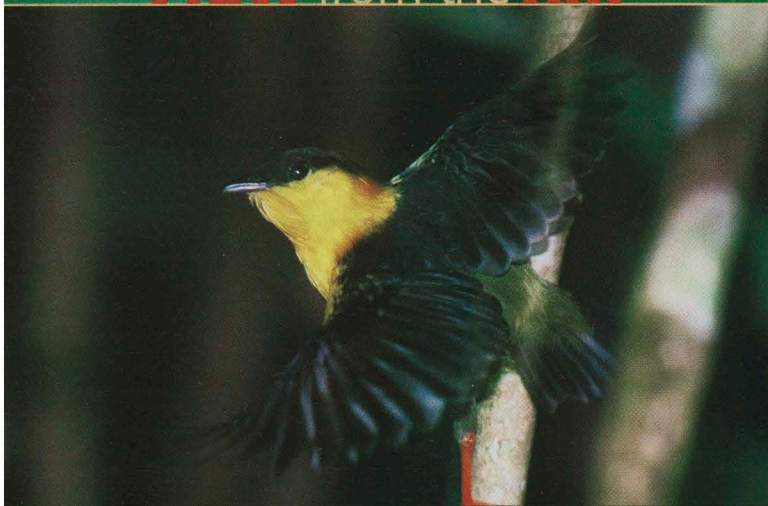
Golden-collared manakins, Panama