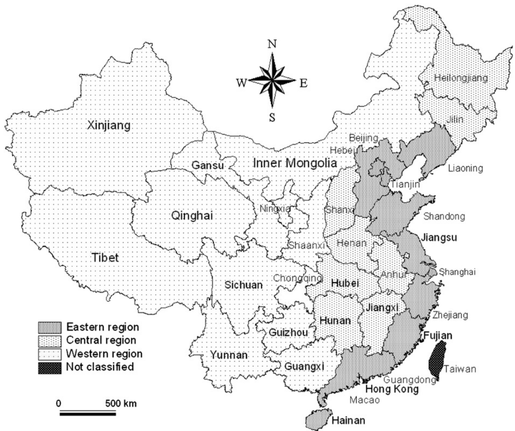
Fig. 1. Provincial regions in China.