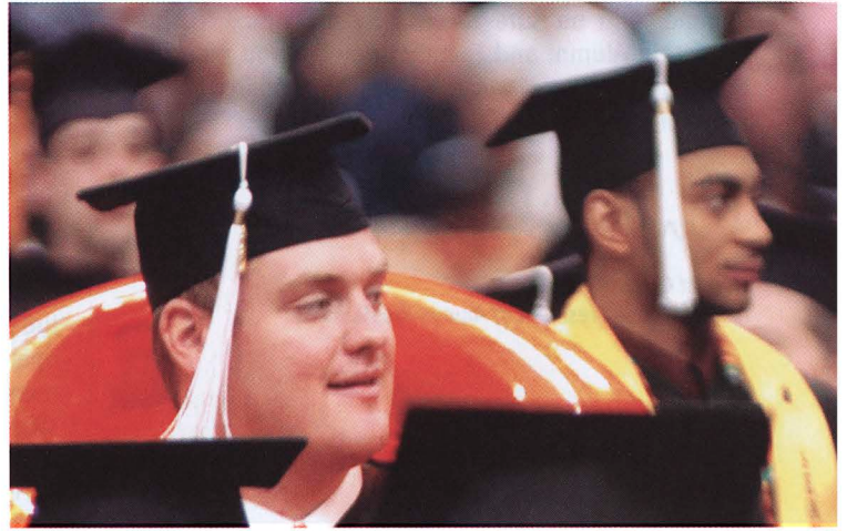
SUMMER 2004 45