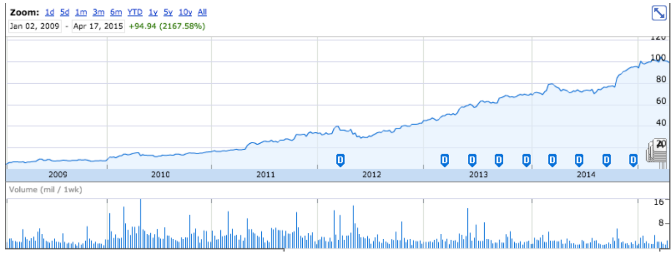
Figure 4. Domino's Share Price from 2009-2015

The company's success is also mirrored in the share price. As was mentioned previously, shares were trading for less than seven dollars when the crisis first struck. This past March, shares were trading for more than $100, which means if an investor had placed funds with the company in 2009, she would have received a return of 13 times her original investment. This increase can be seen below in Figure 4.