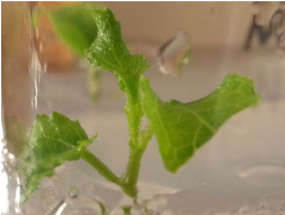
Figure 2. Transgenic poplar containing the SCSV::AS::tNOS construct

Bacterial plasmids containing a copy of P. trichocarpa AS were transformed into A. tumefaciens and then into 717 hybrid poplar. Four individual transgenic events were generated under the control of the SCSV vascular tissue specific promoter. CAMV::AS::tNOS transformations are in progress One replicate of transgenic line 4 can be seen in Figure 2. Following the production of a minimum of three lines per construct, these lines will be grown in the greenhouse and analyzed for changes in biomass production, cell wall chemistry, and nitrogen metabolism properties