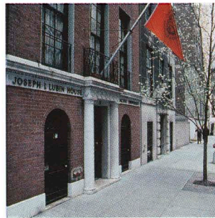
Lubin House, New York City November 2-6, 1998