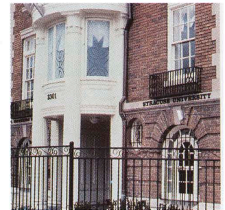
Greenberg House, Washington, D.C. Spring 1999

SCHOOL OF MANAGEMENT SYRACUSE UNIVERSITY