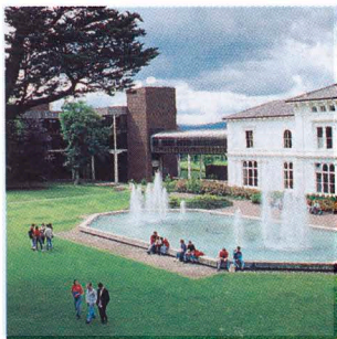
University of Limerick, in Ireland July 12-16, 1998