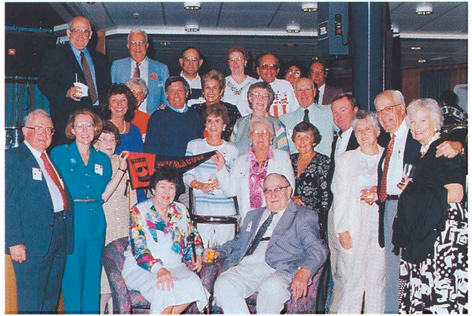
The Big East Alaska trip took alumni to fascinating locales and on a luxurious cruise.

Yes, I want to see the world with Syracuse University. Send more information on the following tours when available.