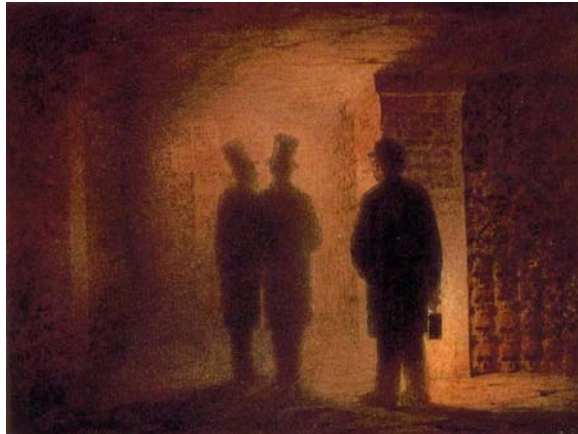
Figure 1.4: The Great Gate of Kiev