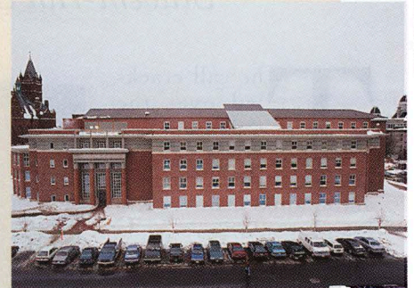
SU's newest structure, Melvin A. Eggers Hall, is home for the Maxwell School.

➤ Julian Bond Visits Campus. As part of the University's celebration of the Martin Luther King Jr. holiday, civil and human rights activist and politician Julian Bond spoke at a dinner in the Carrier Dome. While on campus, Bond also conducted an undergraduate seminar on student participation in the civil rights movement. Bond is currently Distinguished Scholar in Residence at American University and a lecturer of history at the University of Virginia.