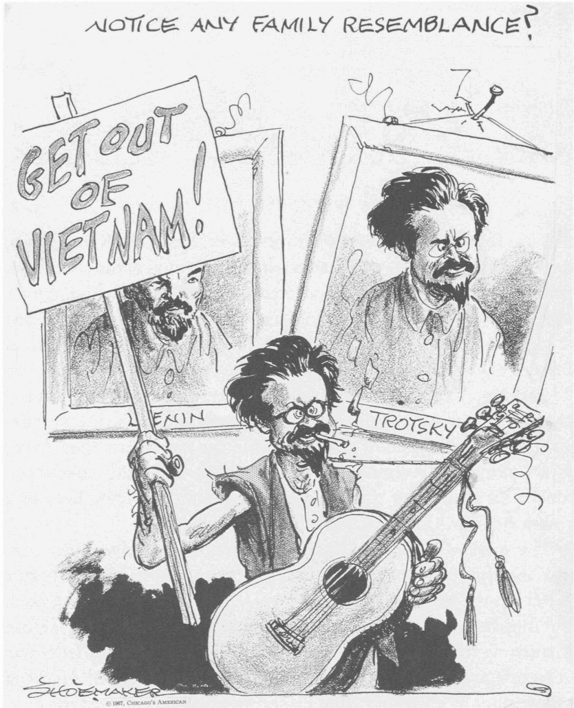
By Vaughn Shoemaker, 1967.

Cartoonists Society Award for Best Panel, Marmaduke was created by Brad Anderson, a 1951 graduate of Syracuse University. Other humor strip collections include those of Bil Keane and Dik Browne. Keane's Family Circus panel portrays the frivolity of family life and especially the antics of children. Browne's Hagar the Horrible observes the daily life of a group of fun loving Vikings (only in the