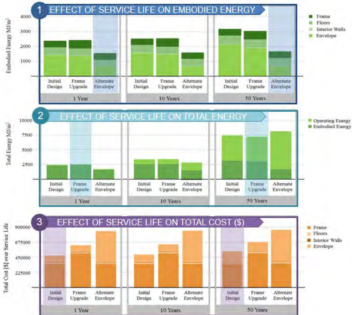
Figure 2. Annotated visualization of embodied energy (sequence 1), total energy (sequence 2) and total monetary costs (sequence 3), at inception (1 Year) and as a result of hazard exposure over service lives of 10 and 50 years, for Initial Design and two design alternatives.

further demonstrate how such assembly-based insights can be used, two design alternatives are respectively evaluated: increasing the size of the columns in the special moment frame (termed Frame Upgrade) and selecting an Alternate Envelope using precast RC panels.