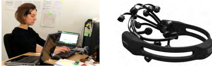
Figure 1. EEG experimental test. Left) Test example, Right) Neuroheadset.