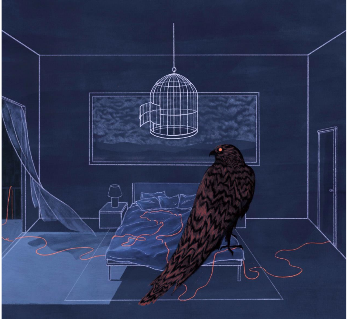
Room #2, Jialun Deng, 2019, Digital