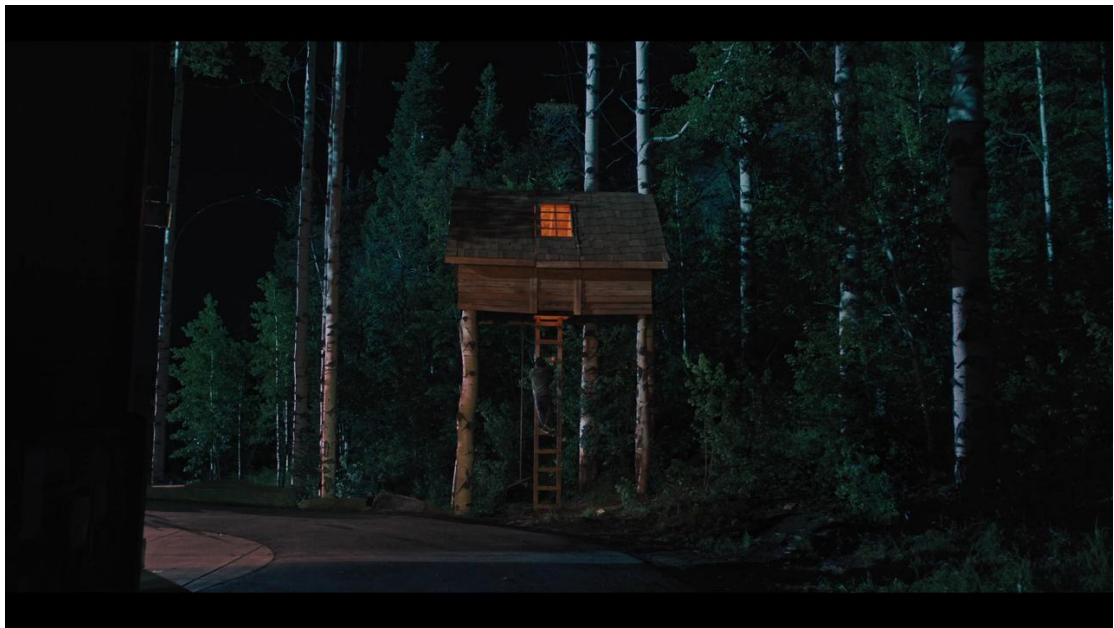
Hereditary by Ari Aster, 2018