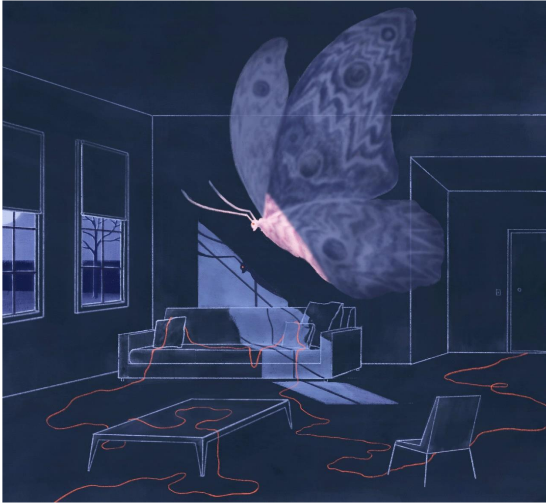
Room #5, Jialun Deng, 2019, Digital