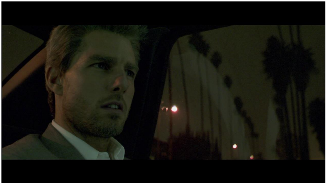
Collateral by Michael Mann, 2004