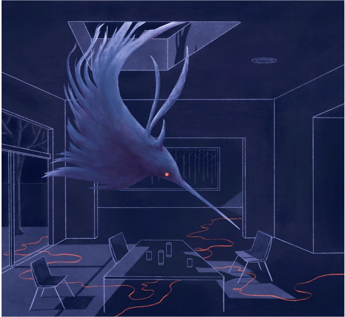
Room #4, Jialun Deng, 2019, Digital