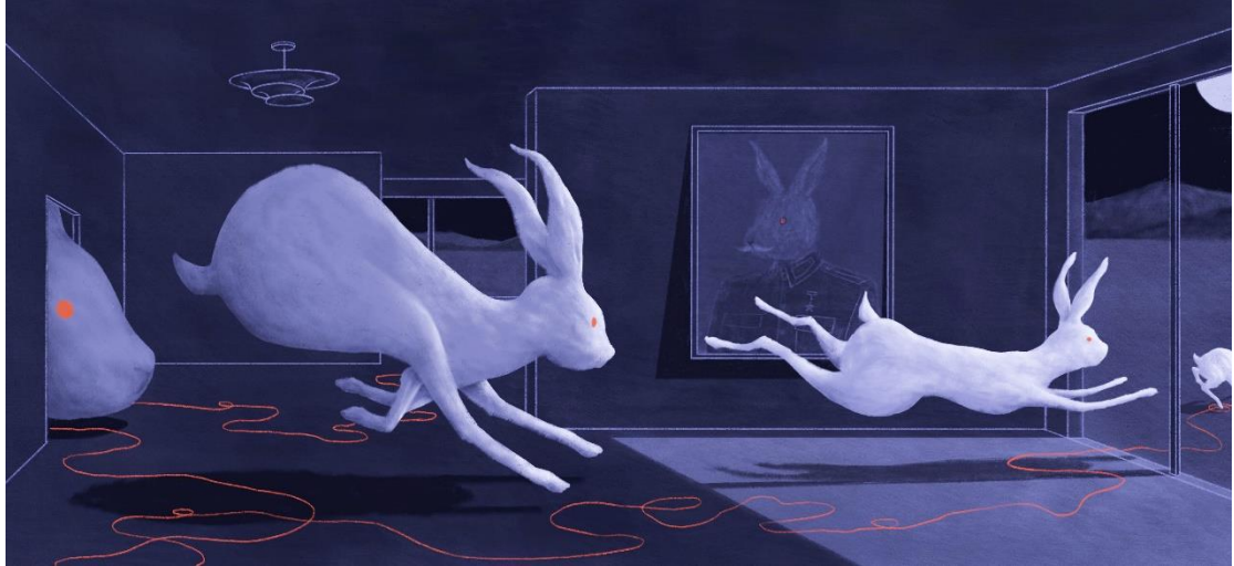
Room #8, Jialun Deng, 2019, Digital