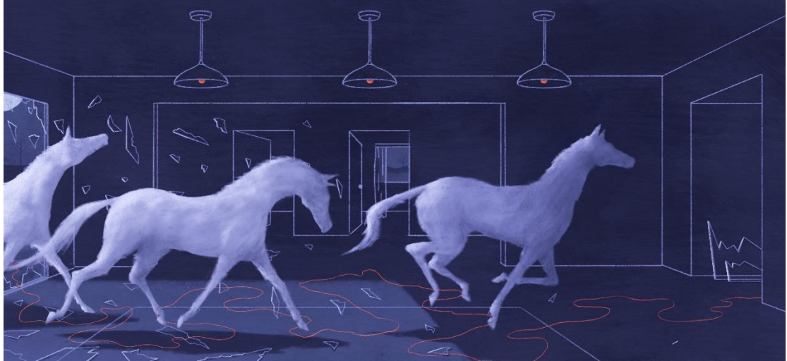
Room #6, Jialun Deng, 2019, Digital