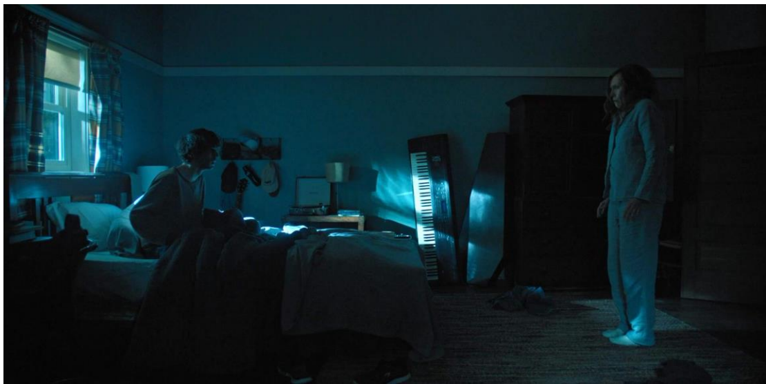
Hereditary by Ari Aster, 2018

Another artistic influence is also a film Hereditary by Ari Aster. The story is about after the family matriarch passes away, a grieving family is haunted by tragic and disturbing occurrences, then begin to unravel dark secrets. 2 The scene in the film shows a disturbing indoor and outdoor environment influenced my choice the color palate and the general feeling of the Body of Work.