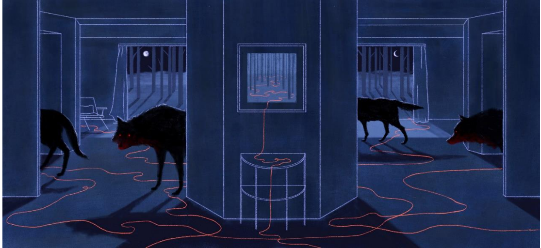
Room #7, Jialun Deng, 2019, Digital