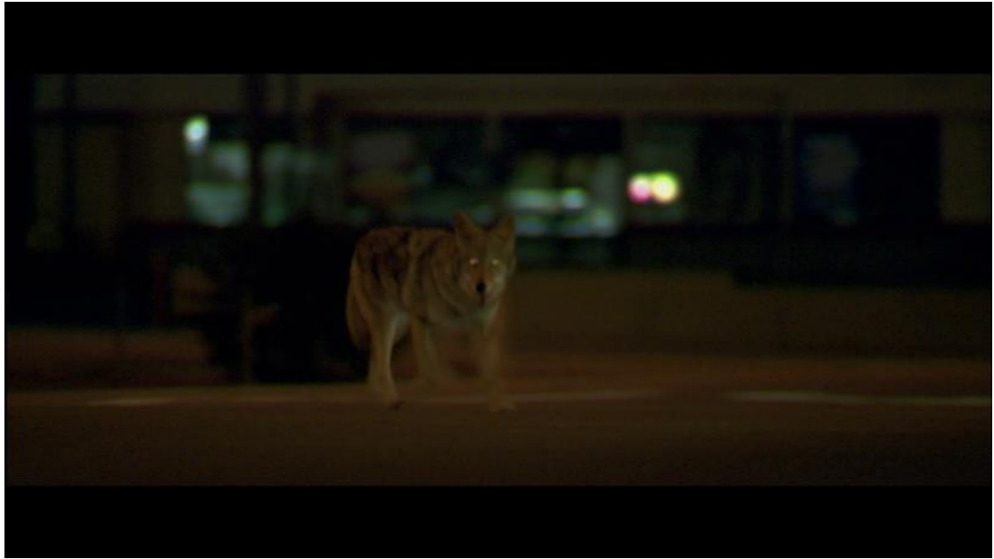
Collateral by Michael Mann, 2004