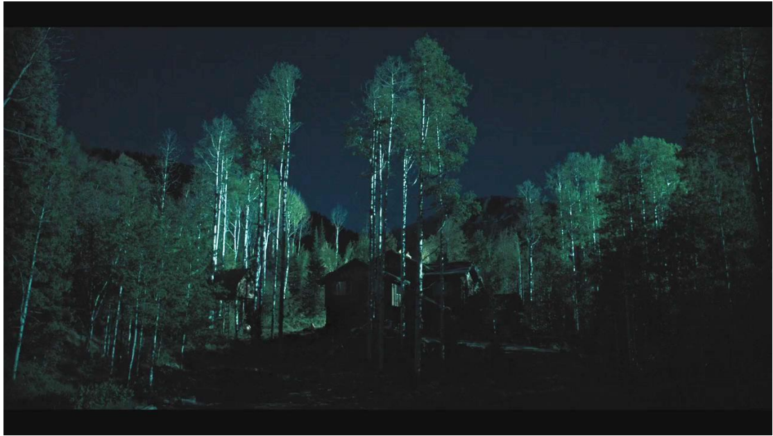
Hereditary by Ari Aster, 2018