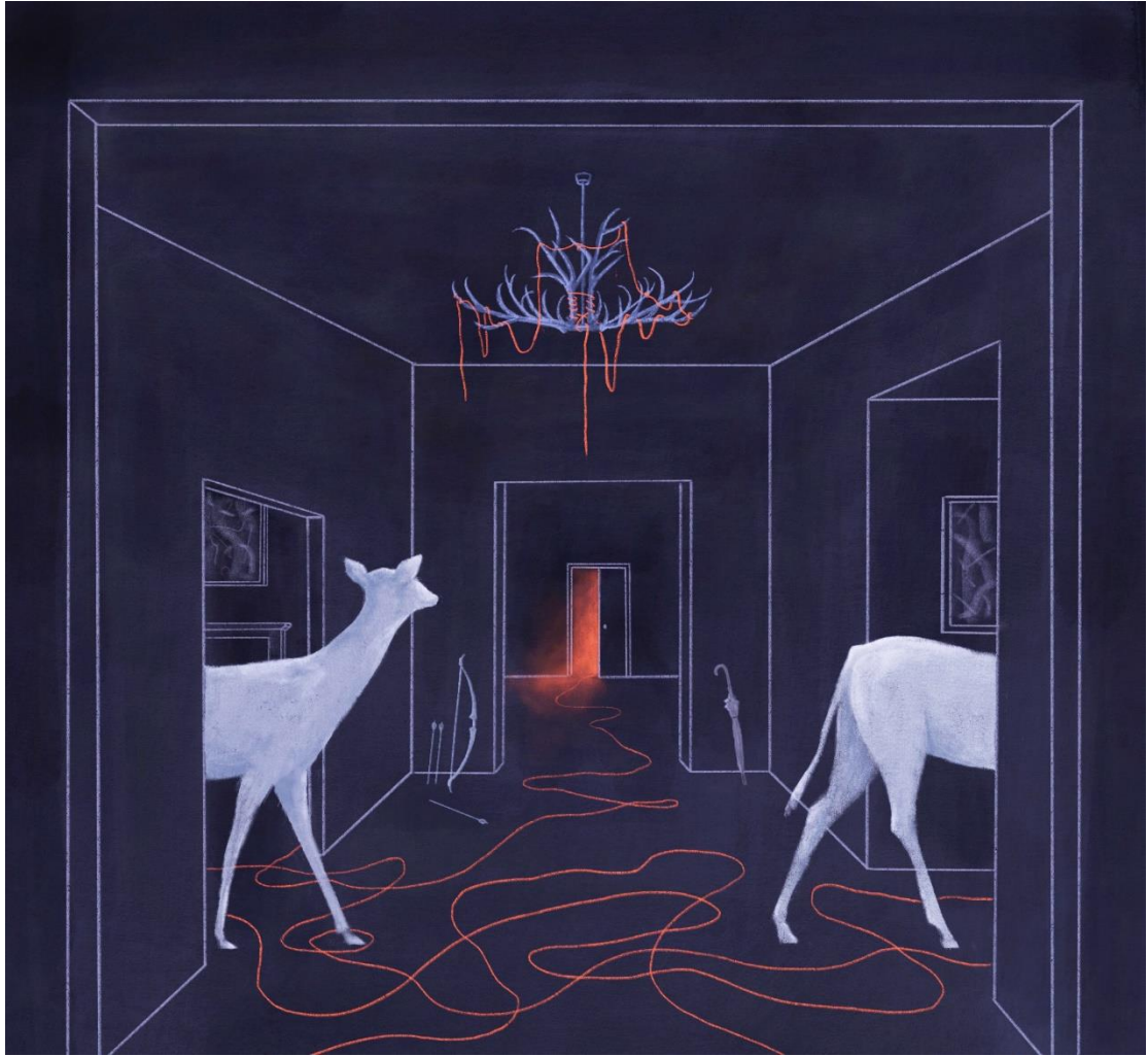
Room #3, Jialun Deng, 2019, Digital