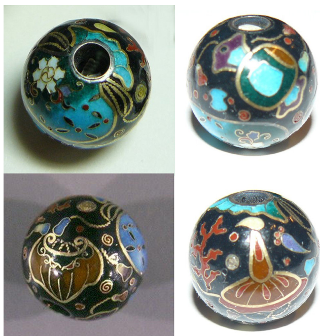
Figure 11. Ojime depicting four treasures from Japanese folklore.

A masterpiece of unsurpassed Late Meiji-early Taisho cloisonné artistry is a rare ojime (Figure 11) in the collection of Fredric Schneider, where within the confines of the surface of a small bead are depicted magical items from the treasure ship of Japanese folklore: Hotei's bag of fortune, Daikokuten's mallet, the lucky rain cape and hat of invisibility, and treasures such as a branch of coral, rhinoceros horn, pearls, and gems. The combination of the tiny sculpted and twisted precious-metal wires with transparent and opaque enamels against a black background conveys the impression of tiny three-dimensional objects floating in space (Schneider 2010: C-2).