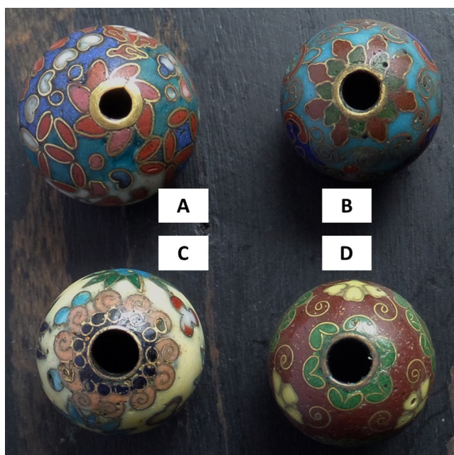
Figure 3. a-b) Doro shippo ojime pre-1870; c-d) ojime likely post-1870. Tiny dots and spirals forming an edge border are a distinctive feature of Japanese cloisonné; 4-5 mm hole diameter.

the glassy shine acquired in the kiln – an attractive contrast to the matte enamels, but not at all similar to Ming-inspired motifs on the intro and netsuke. Gregory Irvine (2017: pers. comm.) observes that the unmatched styles of the wirework and enameling in the three pieces of this ensemble indicate the likelihood that it is an assemblage, and not the work of a single artist. Thus is apparent a divergence in overall style between what seem to be Ming-inspired floral and leaf motifs combined with tiny geometric patches, versus the stripes and murrine seen on Edo glass beads. These stripes and dots perhaps represent continuance of earlier indigenous ojime designs produced prior to Kaji Tsunekichi.