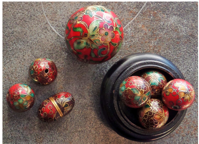
Figure 15. The large (28mm) bead was originally mounted as a kanzashi; from the Kuo Cloisonne atelier, Taiwan, ca. 1975-1985. The smaller (14mm) beads are similar in size to Japanese ojime, but lack the larger holes necessary to accommodate intro cord.