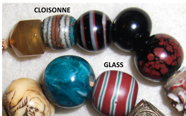
Figure 1. An early white, red, and turquoise cloisonné ojime shows design affinity with an Edo glass ojime (Helmsley 2014).

Glass beads were already popular in Japan for many uses in the early 19th century (Blair 1973:194), including Buddhist prayer beads, as ojime (the little bead used to secure the cords in the Japanese inro pouch accessory set), and for women's hair ornaments ( kanzashi ). Thus, once cloisonné beads could be manufactured, a local market for them likely already existed. One example of what could be an early cloisonné ojime (Figure 1) features simple circumferential bands of red, white, and turquoise, reminiscent of similar stripes on the glass beads also used as ojime in the Edo Period (Blair 1973:227).