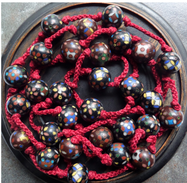
Figure 8. Intro cord with 29 15-mm beads. While the typically Japanese design motifs repeat, the beads show individual color variations

A mysterious string of 29 beads strung on red intro cord (Figure 8) appears to feature post-1870 enamel. Colors include pink, red, light yellow, green, turquoise, blue, white, black (deep cobalt blue when edges examined with penlight and loupe), and chocolate brown. The brown enamel distinguishes these beads from Chinese enamels, where opaque brown is not used in ca. 1900 works ( see also Figures 2,d, 3,d). The better control of pitting and polish also distinguish these beads from earlier doro shippo efforts. The overall design features two repeating patterns: 1) a double circle motif alternating with a five-petal blossom, and 2) a "four-directions" motif alternating with a blossom of six petals of two alternating colors. The designs of the collar motifs around the holes also differ between the two patterns. The tiny elements of which the motifs are composed are very precisely placed, in a manner similar to the brocade-