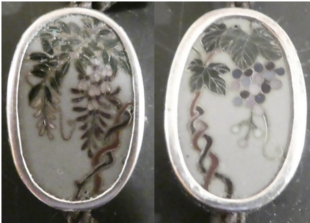
Figure 12. Bead with fine sculptural silver wires delineating naturalistic vines.

The ojime features a tiny spray of purple wisteria and green leaves against a bright engraved silver background covered with pale-lime transparent enamel. Figure 13 illustrates a somewhat similar bead worked in silver with opaque enamel leaves and wisteria blossoms floating above a transparent aqua ground.