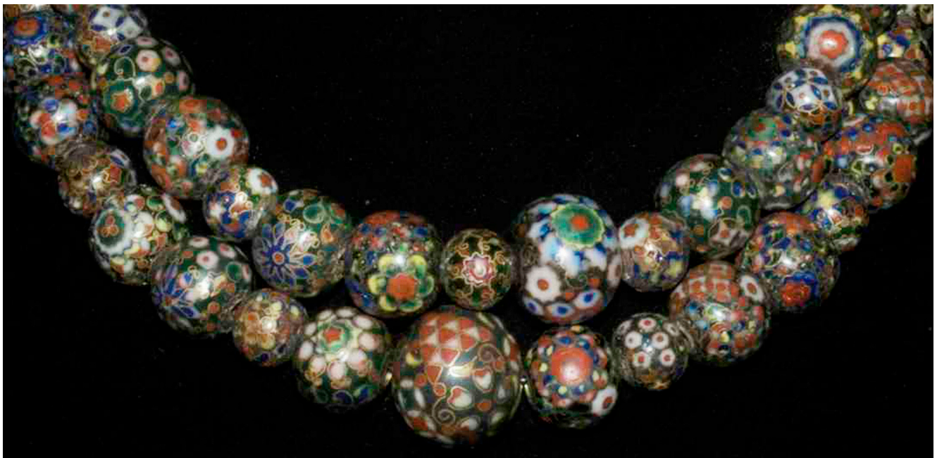
Figure 6. Japanese cloisonné beads in the style of those in the V&A Museum collection showing floral patterns with bi-colored petals (Frederick Bourguet-Chavez collection).