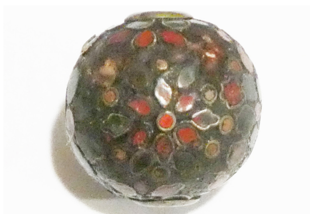
Figure 16. Lacquer ojime with tiny, neatly applied motifs reminiscent of the doro shippo style of decoration (courtesy/ copyright, Fredric T. Schneider).