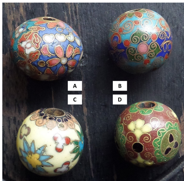
Figure 2. a-b) Doro shippo ojime pre-1870 with indented petals on the pink blossom, a typical Japanese motif; c-d) ojime likely post-1870 with tripartite motifs in b-d. All ca. 15 mm in length.

flowers with two-tone petals in red and pink and dark blue and white, blossom petals arranged in rows or tiny trefoils, and a geometric net in the “four-directions” pattern of ovals forming connected circles. The peony-type flowers are reminiscent of Chinese cloisonné, where flower petals are often blends of two or more hues. The patches of tiny geometric patterns are a distinguishing feature of larger doro shippo pieces, very much resembling patches of textile patterns from which they are believed to have been derived (Schneider 2010:27). Although difficult to be certain from only viewing a photo, the enamel colors appear to be the doro shippo hues of turquoise blue, deep pink, red, dark blue, light yellow, white, and purple. Distinctive tiny cloud motifs that resemble paperclips are arranged at right angles to form the “four-directions” net of circles; identical tiny clouds may be seen in many larger mid-19th-century Japanese doro shippo works (Figures 2-3). The surface is matte.