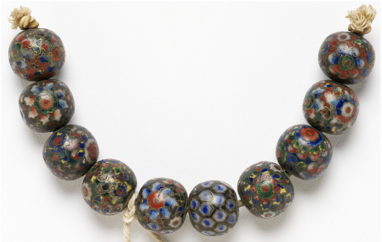
Figure 5. Ten cloisonné ojime acquired at the International Exhibition of 1867 in Paris (©Victoria & Albert Museum, 613-1868).