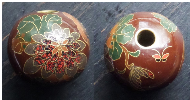
Figure 17. Lacquer cloisonné (17 mm diameter); composition and motifs are in the style of larger lacquer cloisonné works produced in the 1890s.

After the 1920s, cloisonné bead production in Japan seems to have ceased. Ironically, China then picked up the manufacture of these beads. But that is another story.