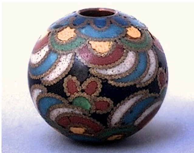
Figure 10. Simple yet sophisticated design featuring twisted wire and matte enamels in bright colors (Frederick Bourguet-Chavez collection).

Examples of flat-twisted-wire use in Japanese cloisonné can be found in pieces such as small vases with an overall decorative style and enamels indicating late Meiji or Taisho (1912-1926) production. A unique bead in the collection of Frederick Chavez features flat twisted wire as an important element in the overall design (Figure 10).