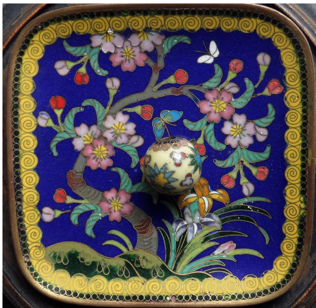
Figure 9. Small Inaba dish with matching dot and spiral motifs on the ojime.

1830 wares. These efforts pre-date the less frequent use of this technique by Kaji-tradition workers on metal-substrate.