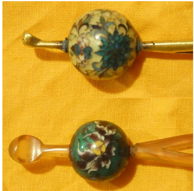
Figure 14. Kanzashi styles from around the 1920s.

The two kanzashi in Figure 14, with hairstick styles typical of the 1920s, display a painterly technique mixing opaque and transparent enamel for a more lush representation of the flower petals. Curiously, half a century later, this mixed application of opaque and transparent enamels was a prominent feature of the cloisonné work of Ming-Chiao Kuo of Taiwan, a painter and art professor (Figure 15).