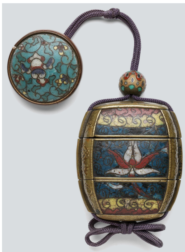
Figure 4. Cloisonné intro, ojime, and netsuke ensemble. The ojime design appears more in the tradition of Edo glass beads, in contrast to the lotus and leafy vine motifs derived from Ming cloisonné (©Victoria & Albert Museum, M.235:1-1912).

The first documented works of Japanese cloisonné to appear in Europe were at the 1867 International Exhibition in Paris where 27 such items were exhibited. Of these the Victoria & Albert Museum acquired a small cylindrical three-tiered box, a kettle, and 10 ojime beads (Irvine 2011:78) (Figure 5). Apart from the pair of scroll weights mentioned above, these are the only dated pre-Meiji cloisonné beads from Japan. Their technical aspects are impressive; minute and fine wire designs, often with two colors in the same cloison – green or blue on yellow, red