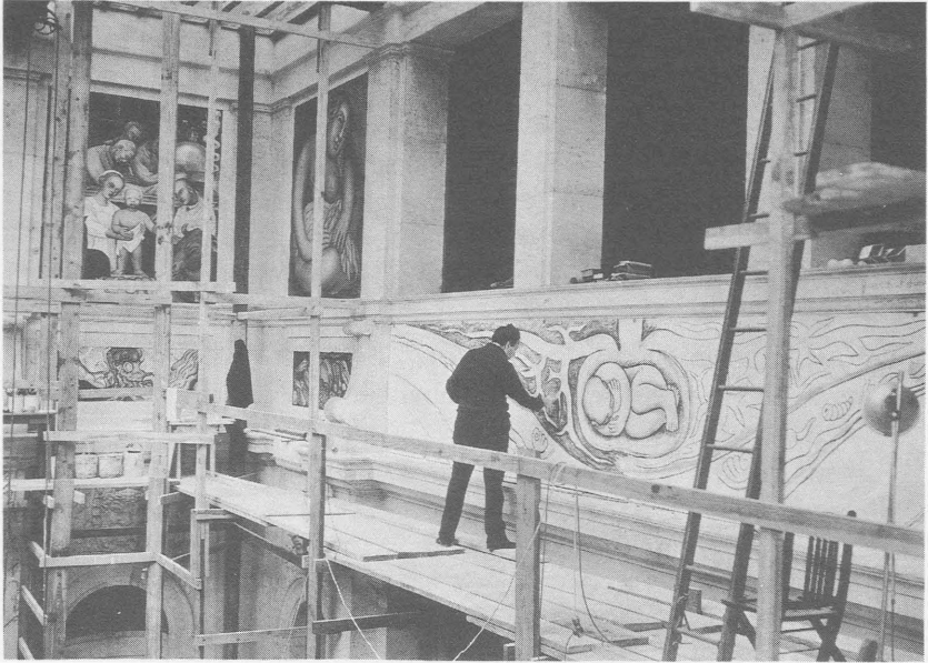
Diego Rivera at work on his murals for the Detroit Institute of Arts (ca. 1932).