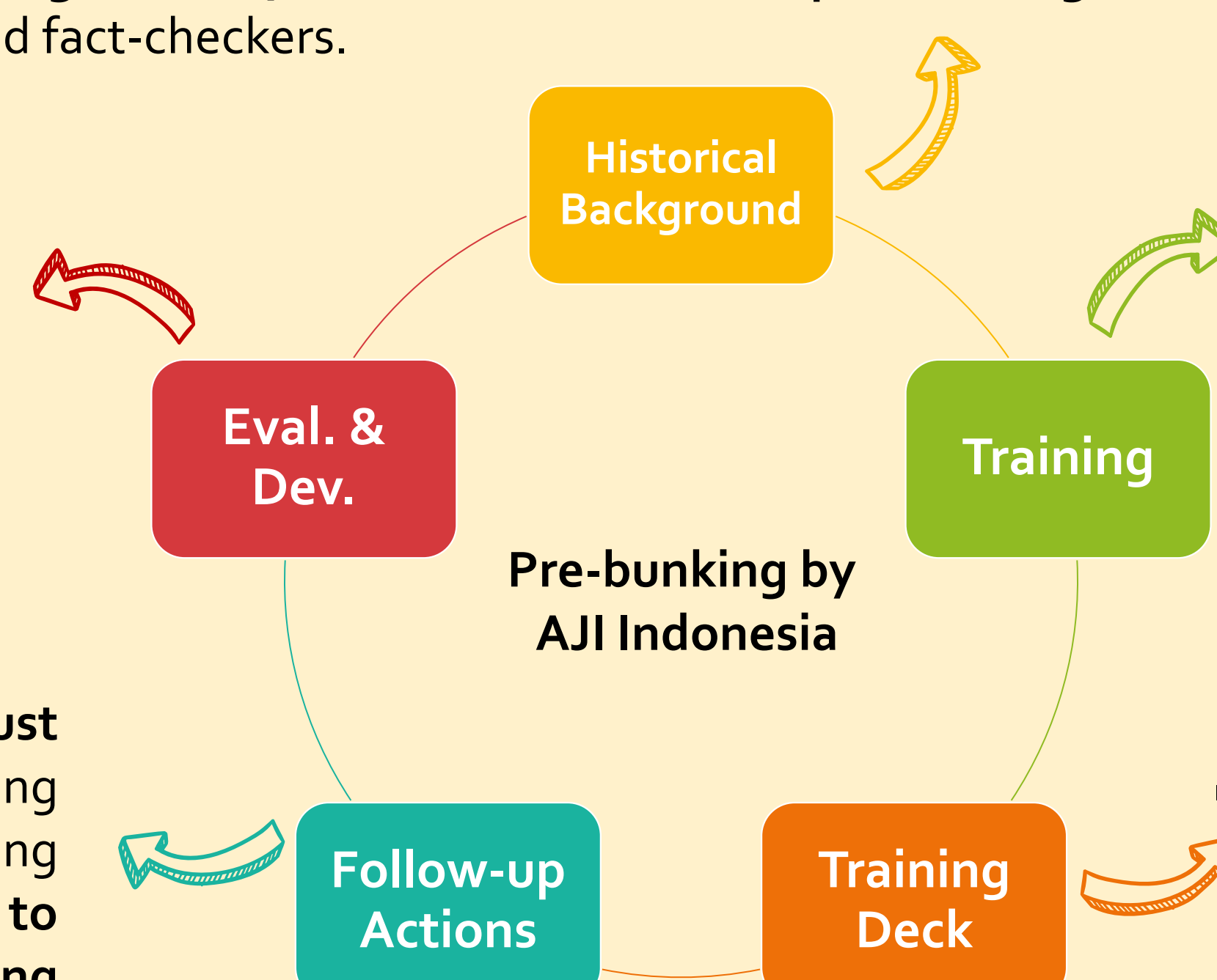
Figure 4. Initiative Circle Process