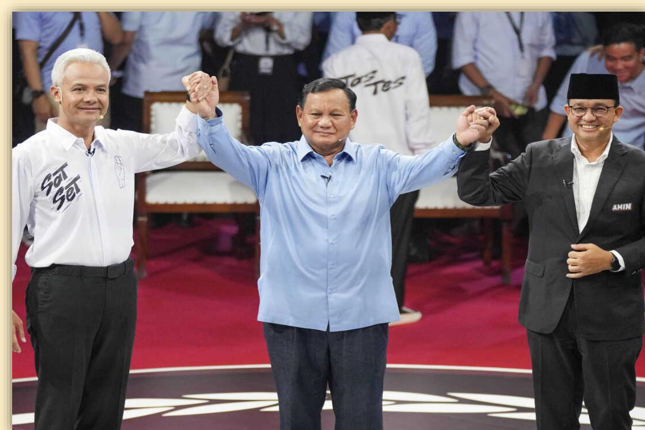
Figure 1. Candidates for Indonesia's Presidential Election 2024 3

Indonesia's 2024 general election is a democratic celebration that has been meticulously planned and prepared by numerous interested parties, including media. This is due to the residual effects of the previous election's controversy, which seems unfinished and continues to cause tension and division in society, as well as the threat of harmful content such as mis-disinformation and hate speech that undermines social cohesion 1 . Political deception and misinformation are actual threats that polarize society into two extremes 2 .