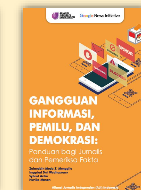
Figure 6. Guidance Book 10