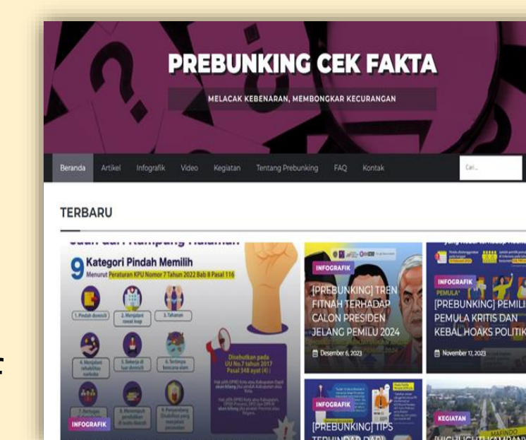
Figure 5. Pre-bunking Website 9