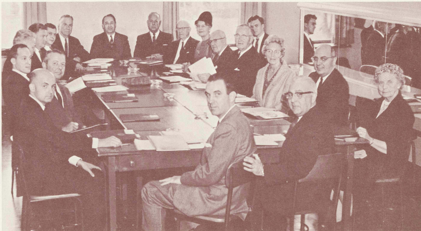
The Board of Trustees of Syracuse University Library Associates and conferees at a recent meeting. See opposite page.