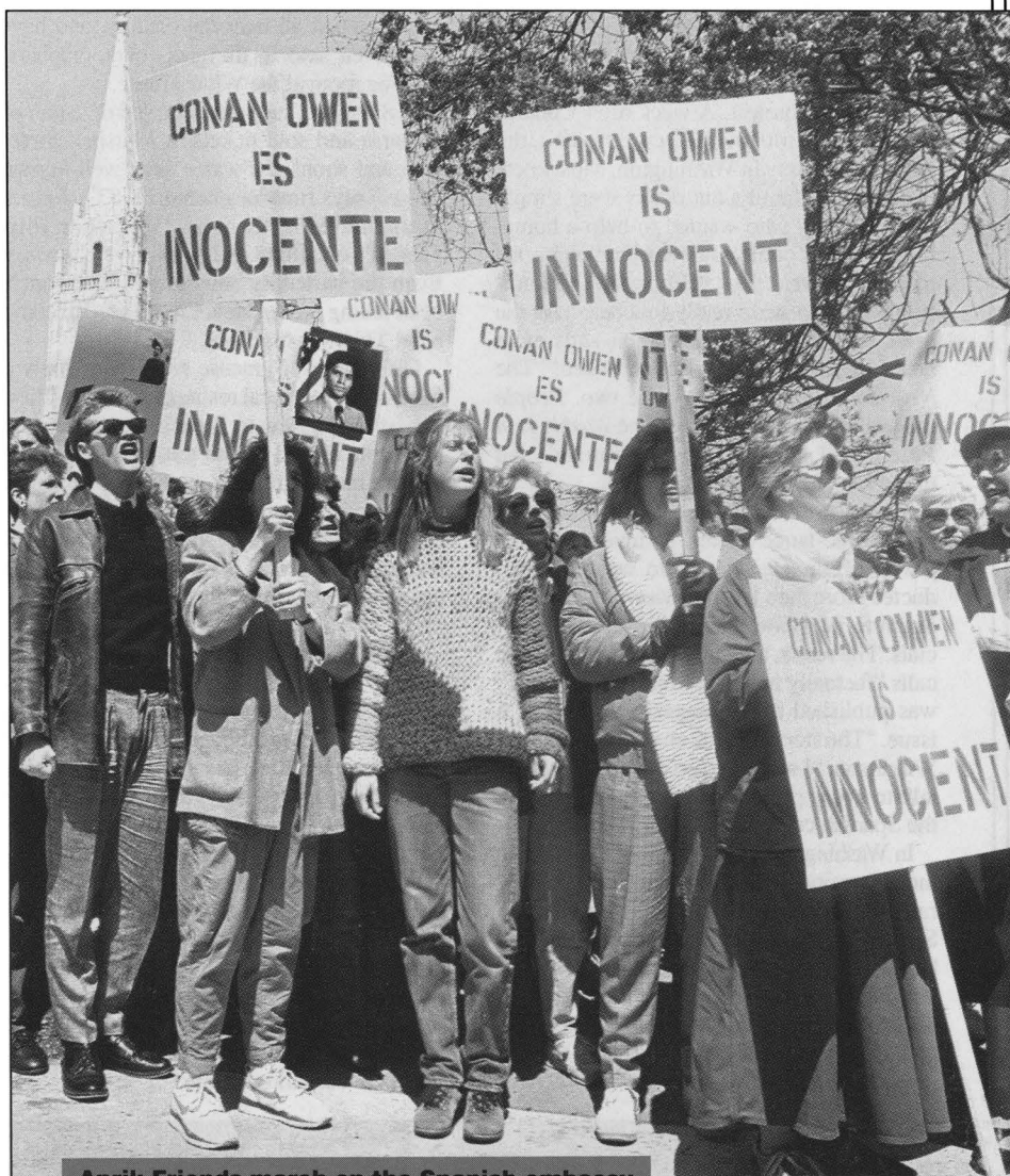
April: Friends march on the Spanish embassy