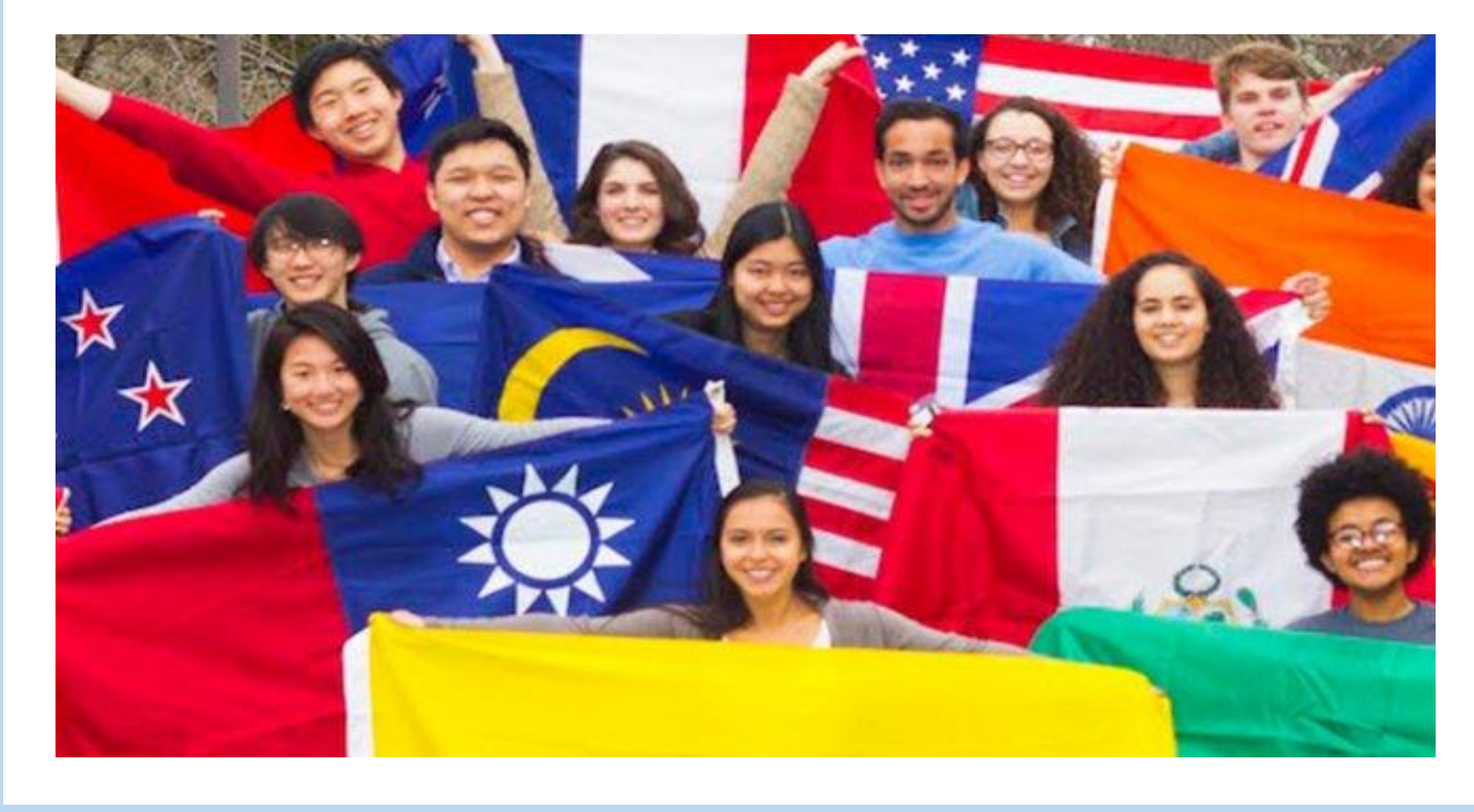
Fig 2: https://international.princeton.edu/international-students-scholars