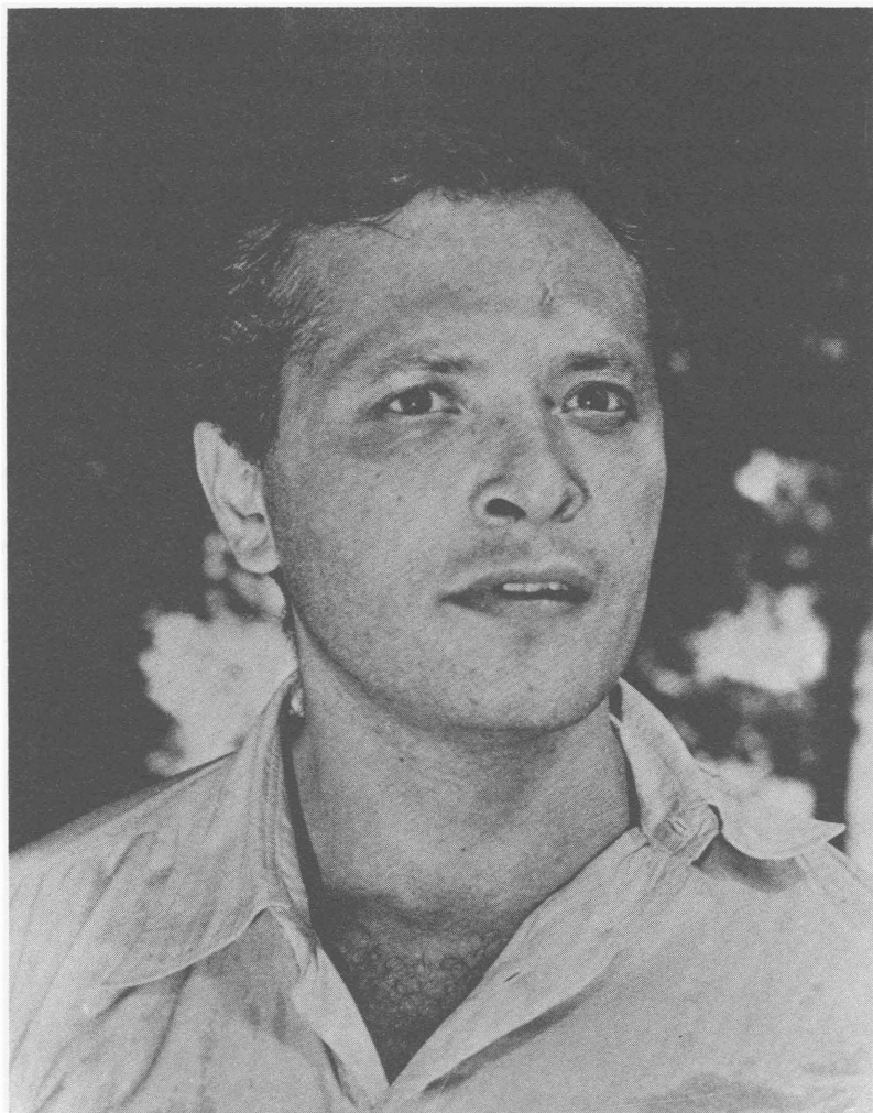
The young Delmore Schwartz.