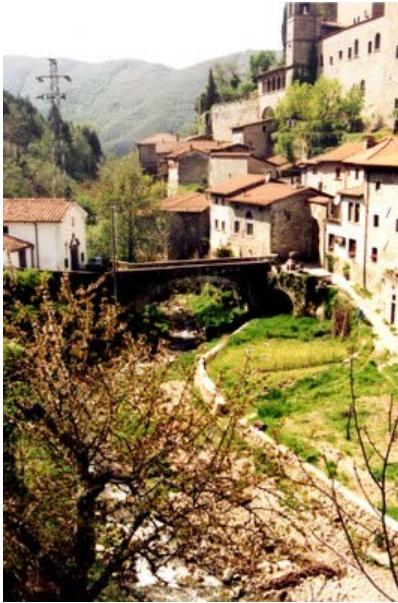
Figure 7: Color often become less intense with distance.

Colors also give us clues to distance and 3-dimensionality. I will mention two different ways in which this is true. First, colors often become less intense with distance (see figure 7) This is because some of the light is absorbed as it passes through the atmosphere. We are accustomed to seeing more remote objects as less intensely colorful. Sometimes, when we look out on a very clear day, we are astonished to see how close the distant hills appear to be. Because the atmosphere is so clear on that day, we see an unusual intensity in the colors of the hills, which confuses us.