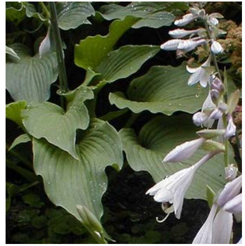
Figure 10: The undulations in a petal or leaf make the edges appear more complex than they actually are.

instance), the lines will be more noticeable, and the feature will appear flatter. The undulations in a petal or leaf make the edges appear more complex than they actually are. (Of course, some do have intrinsically complex shapes.) So the lines around such features also give clues to their 3-D shapes (see figure 10).