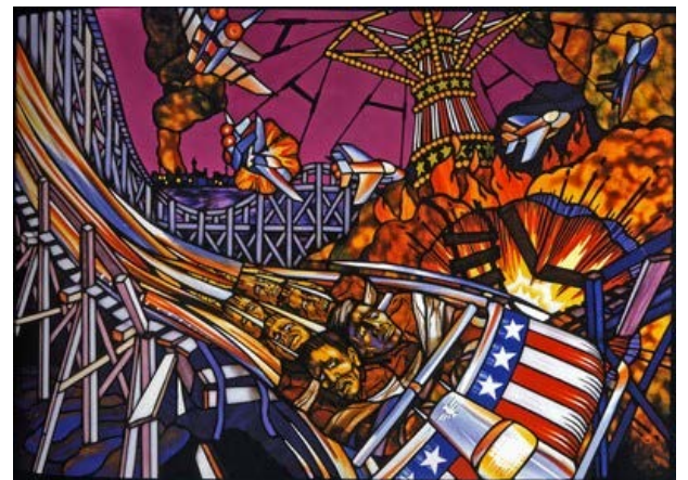
Figure 6: Too Long at the Fair (1990), stained glass 30" x 40",