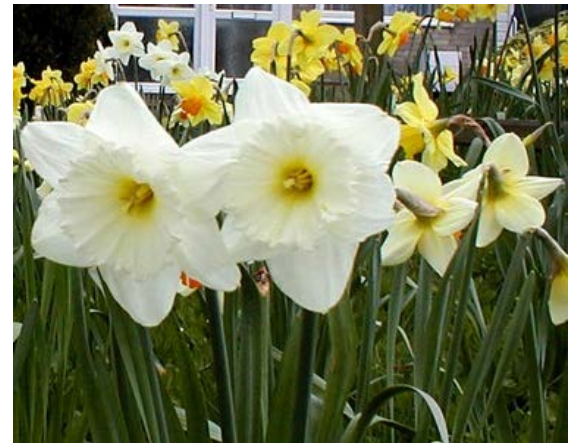
Figure 2: Daffodils near and far. If two objects are of about the same actual size, the more distant one will appear to us smaller than the closer one.

For those of us fortunate enough to have two good eyes, our principal method of perceiving depth is through stereopsis. Our eyes are a couple of inches apart in our faces, so they see slightly different images. Figure 1 illustrates this. The brain makes sense of the differences by interpreting the scene as 3-dimensional. A similar effect can be experienced by moving the head slightly, even with just one eye open. We can also judge relative distances from the movement of objects across our field of view. If two people are walking at the same speed but on opposite sides of the street, the closer one will appear to be going faster than the more distant one. Some movies simulate stereopsis.