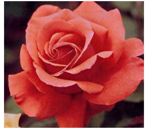
Figure 8: A monochromatic rose: notice the apparent color variation.

its angle with the light source varies. The color variation gives a clue to an object's 3-D shape. Also, one object can cast a shadow over another, changing the apparent color shade. This gives us a clue to the relative positions in 3-D space of the two objects. So, an artist needs a varied palette to hand.