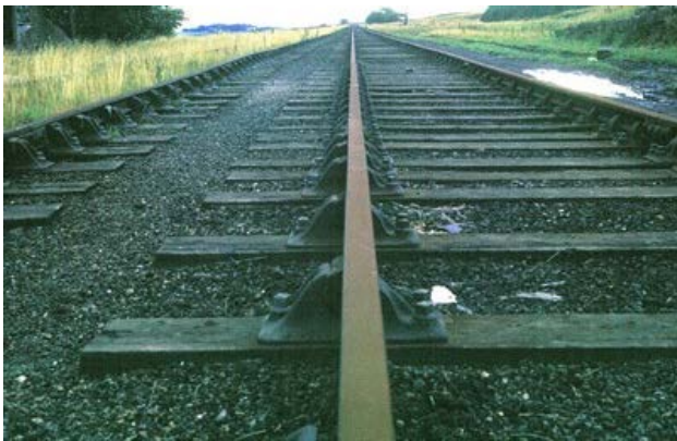
Figure 5: Perspective: the railroad tracks appear to converge, even though in reality they are parallel.

dimensionality. This is actually closely related to apparent size. The shapes of real 3-D objects are distorted by distance. In the classic example in Figure 5, the railroad tracks appear to converge, even though in reality they are parallel. Imagine what would happen to a train if they really did converge! We use perspective unconsciously in the material world. We do