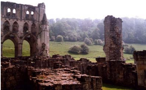
Figure 9: Edges become less distinct with distance as shown with Riveaux Abbey.

Lines also carry information about depth. Lines don't really exist in nature. What we really see are the edges of things, because that is where there is a contrast in color and value. Edges become less distinct with distance. See Figure 9. This is partly due to the atmosphere, which distorts the light and reduces differences in color intensity, and partly due to our limited (though impressive) optical resolving power.