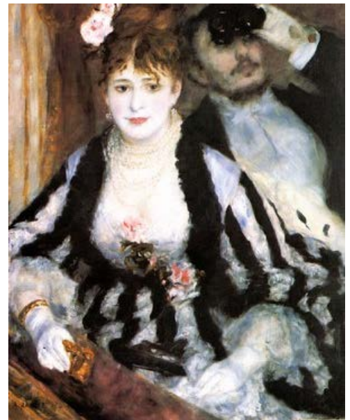
Figure 12: La loge (1874), by Pierre-Auguste Renoir in which the woman does appear to be in better focus than the man.

24" x 14", Robert Oddy, drawn in are the directions of flow, which guide the eye to the lower flower.