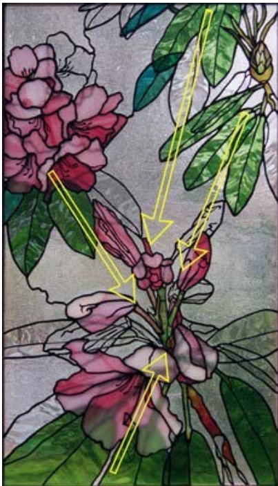
Figure 13: Rhododendron (2000), stained glass

Even if the whole picture is clearly delineated, the directions of flow in the design will draw the eye toward focal points. In Figure 13, I have drawn in the directions of flow, which guide the eye to the lower flower.