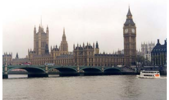
Figure 4: Partially hidden buildings at Westminster.

dimensionality. This is actually closely related to apparent size. The shapes of real 3-D objects are distorted by distance. In the classic example in Figure 5, the railroad tracks appear to converge, even though in reality they are parallel. Imagine what would happen to a train if they really did converge! We use perspective unconsciously in the material world. We do