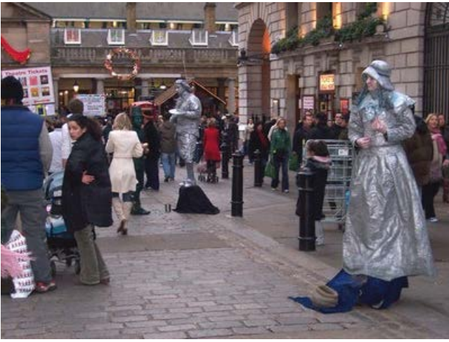
Figure 3: Differences in depth: see the silver-clad woman in the foreground and the building in the background at Convent Garden, London.

The apparent size of things is an important clue to depth. If two objects are of about the same actual size, the more distant one will appear to us smaller than the closer one. Look at the daffodils in Figure 2. We also use anomalies in the apparent sizes of different kinds of object to aid in depth perception. For instance, we know that a two-storey building is usually much bigger than a person, but if that difference is not apparent in the image, we infer that they are at different distances. See the silver-clad woman in the foreground and the building in the background in Figure 3. Another implication of this apparent size effect is that textures, such as ripples on water or leaves on a tree, may be clear in the foreground, but not in the background.