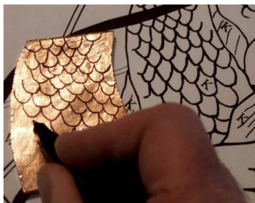
Figure 2: First draw the design on the copper foil.

A copper foil overlay is a thin layer of copper, shaped as required and stuck to the surface of the glass. There are several ways of using this technique.