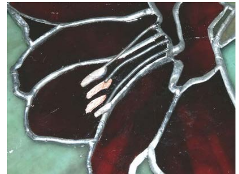
Figure 10: Stamen made with wire and copper foil, from Amaryllis.

Hold the foil down with a small piece of wood, such as a tooth pick, while you solder, and press it down again when the overlay is cool – it should re-stick. If it is still loose when the panel is finished, apply a little glue. Glass can crack if it is heated unevenly. This happens most frequently if you are working on an overlay, with the soldering iron, in the middle of the piece of glass.