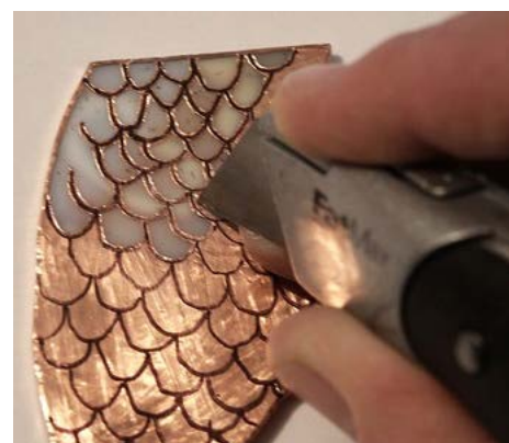
Figure 3: Cut away surplus copper foil with a craft knife or razor blade.