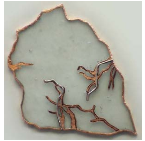
Figure 9: Reinforcing an overlay with brass wire.

I used it for the filaments (parts of the stamen). The anthers are copper foil. They are initially stuck to the glass, but I rely on the wire filaments to hold them in place. In Barque (figure 11), the rigging is fine copper wire. I made the rope ladders before attaching them to the panel.