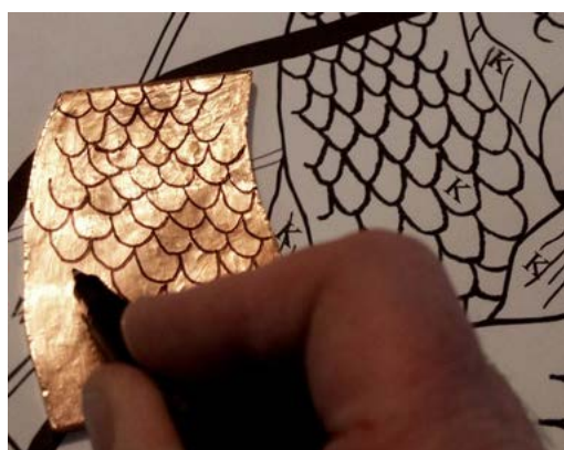
Figure 2: First draw the design on the copper foil.

A copper foil overlay is a thin layer of copper, shaped as required and stuck to the surface of the glass. There are several ways of using this technique.