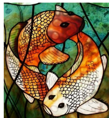
Figure 1: Koi (2006) detail.

In a previous article, I have mentioned my view that stained glass work is akin to impressionism. We use the features of the glass to suggest detail in our subject matter. However, I often find that for some details, this approach is not adequate. For an example, see the scales in Koi, figure 1. It is also not always practical to implement this fine detail by joining large numbers of very small pieces of glass. In this article, I will talk about methods that produce effects compatible with the 'lead' lines of traditional stained glass, namely the use of copper foil overlays and wire.