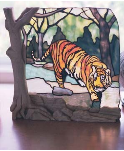
Figure 8: In Tiger (1998) some of the stripes are overlays, and some are enhanced joins.

I used it for the filaments (parts of the stamen). The anthers are copper foil. They are initially stuck to the glass, but I rely on the wire filaments to hold them in place. In Barque (figure 11), the rigging is fine copper wire. I made the rope ladders before attaching them to the panel.