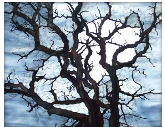
Figure 7: Small overlays make up Oak Tree (2008).

In the Oak Tree panel (figure 7), you can see examples of these techniques. The contours