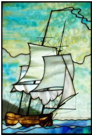
Figure 11: In Barque (2008) the rigging is fine copper wire.

If you are working on small overlays, such as the twigs in Oak Tree (figure 7), it is usually sufficient merely to make sure that the iron does not dwell in one spot – keep it moving, do the job quickly. For larger overlays, make and solder the overlay on a piece of scrap glass, which may crack without serious loss, and then attach it to the panel.