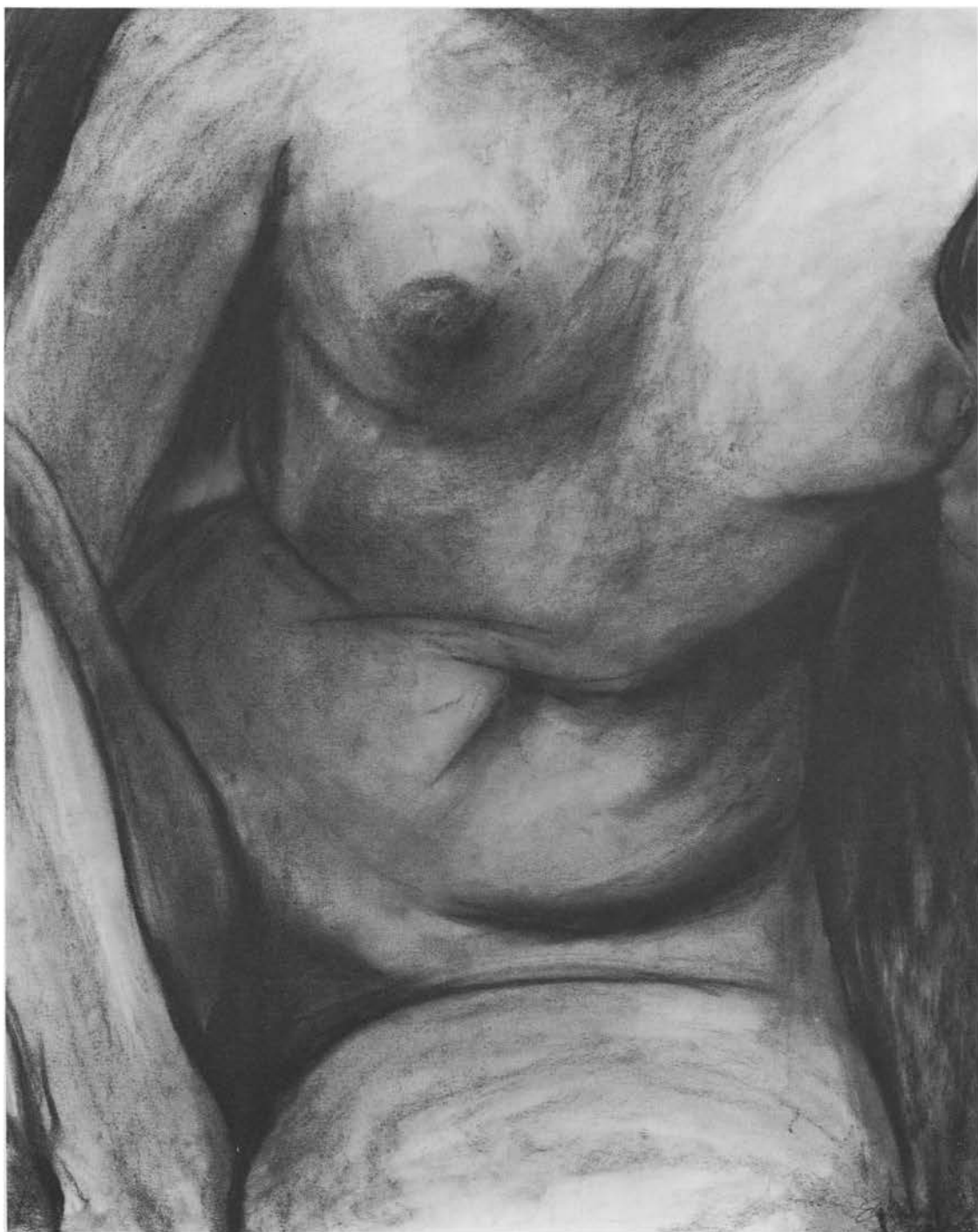
Sensuous Nude Figure Charcoal 24" x 18"