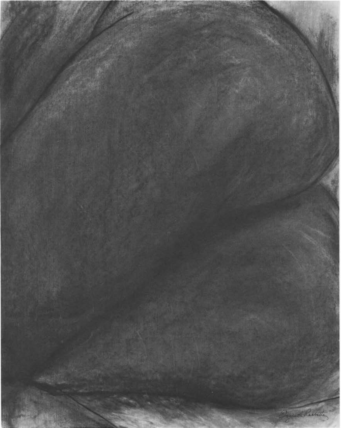
Massiveness Charcoal 24" x 18"