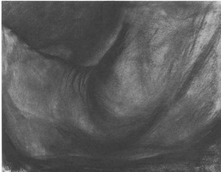
The Almighty Back Charcoal 18" x 24"