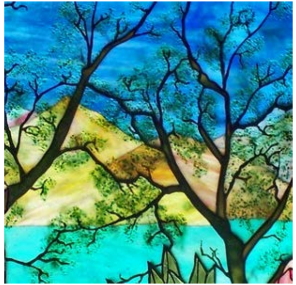
Figure 8: Rhododendron (2009) detail, Robert Oddy.

Figure 7: Wildflowers (2006) detail, Robert Oddy. larger swimming penguins are part of the second layer. The black parts are pieces of glass cut and incorporated into that layer. They are quite distinct, but are seen through the ripples of the ice white glass. The other swimming penguins are painted onto the colored glass in the second layer, some on the front and others on the back, so that the amount of diffusion varies.