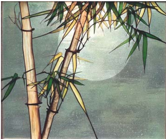
Figure 1: Bamboo (1985) 24" x 30", Robert Oddy.

The first thing we need to learn is that plating should only be used when a satisfactory effect cannot be produced with a single layer of well-chosen glass. Plating is time-consuming. It probably takes more than twice as long to make a two-layer part of a window as a single layer. And if you ever have to repair a plated panel, you will discover the true cost of plating! (See my article “The Fall and Rise of Owl” in Glass Patterns Quarterly , Vol 23, No 4, Winter 2007.)