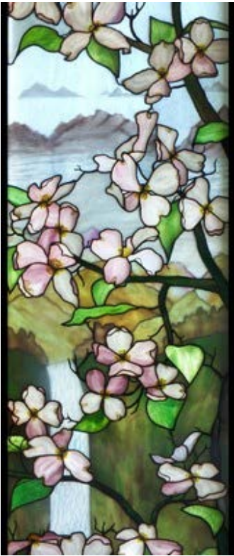
Figure 5: Dogwood Scroll (2007) detail, Robert Oddy.

In some places, this is done by attaching a second layer of glass behind the first; in other places a copper foil overlay is used.