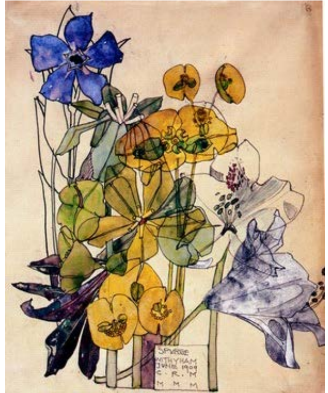
Figure 6: Spurge, Withyham (1909), pencil & watercolour, Charles Rennie Mackintosh & Margaret Macdonald Mackintosh.

Plating can also accent movement as shown in Figure 9 in this small ornamental piece depicting penguins in Antarctica. I used plating to give the impression of penguins swimming under the water and around the ice flow. The water is two layers of glass: on top is ice white ripple, and under that is a blue-green art glass. The