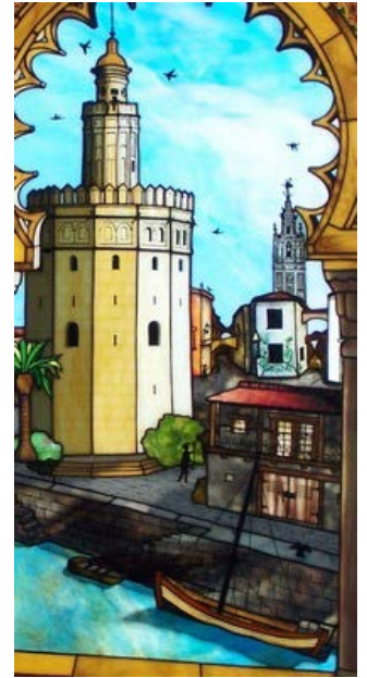
Figure 4: Seville (2009) detail Robert Oddy

Lead lines, or soldered copper foil lines, make for sharp silhouettes in a panel. Sometimes a softer line is more effective, for the outline of a distant mountain, for example. This can be achieved by incorporating this detail into a second layer of glass behind an opalescent glass which diffuses the lines. I frequently use Youghioghney's ice white stipple glass as a diffuser. The colors are all in the second layer, and are not affected by the ice white, except to soften them. In Dogwood Scroll, part of which is shown in Figure 5, the foothills are outlined in the second layer, the distant mountains are painted on the second layer, and the waterfall is a clear granite texture glass, all plated behind ice white stipple glass.