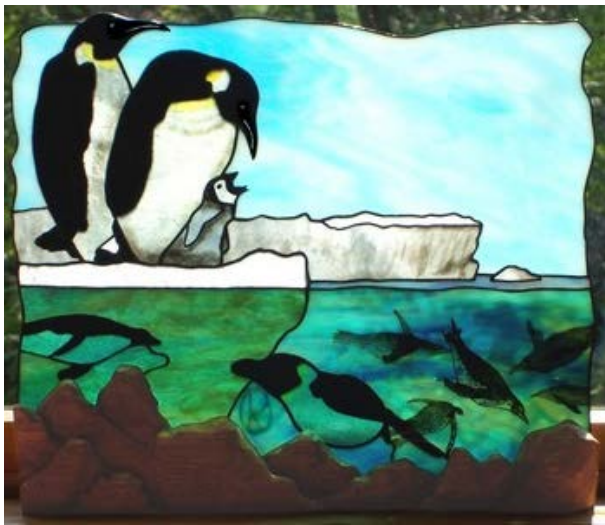
Figure 9: Penguins (2008) ornament with carved wood, 14" x 12", Robert Oddy.

Plating requires care and attention to detail. If pieces in different layers are not lined up accurately, the lines can appear very thick, which detracts from the artwork. Whenever you intend to plate, you should test the glass combinations by holding them up to the light. The effects are not always what you might expect. Combining sheets of glass is not like mixing paints, glass acts as filter.