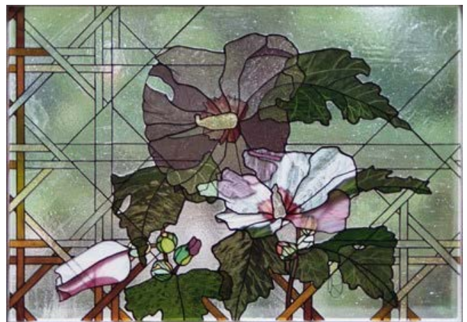
Figure 2: Hibiscus (1993) 22" x 31", Robert Oddy.

Just as olive water glass used to be hard to find so is a realistic skin tone color, especially the skin of an elephant god. I used a combination of solid pale pink opal and various shades of amber cathedral glass to produce a tanned skin color in Figure 3. If you have a glass that you particularly like, but you can't find it in a ripple texture that you want, you can plate it with a clear ripple glass. Remember that the effect will