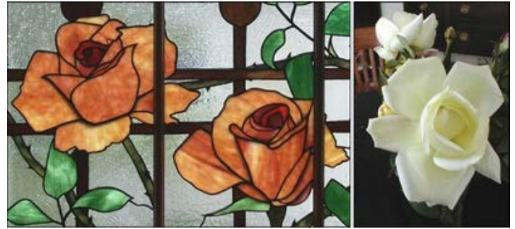
Figure 1: Stained glass roses have outlines, a real rose does not.

In representational art, lines often seem to get in the way. A blossom made with traditional stained glass techniques has black lines around the edges of each petal. A real blossom does not (Figure 1). Very few things in the real world have black outlines — neither natural nor artificial objects. What we see is not a line with thickness but a transition from one surface with its colors and texture to another with a different appearance behind it or in front of it. If we focus our eyes on an edge in the real world, the transition is sharp or sudden, but there is still no line, even a thin one. If the edge is out of focus, the transition is blurred or more gradual. It is still not a line, even a grey one. We might regard certain things in the real world as lines, such as cables and thin tree branches, but such a line is really a pair of transitions very close together. Sometimes, we perceive lines within the texture of things—the veins of a leaf, the crests of the ripples or waves on the surface of a body of water.