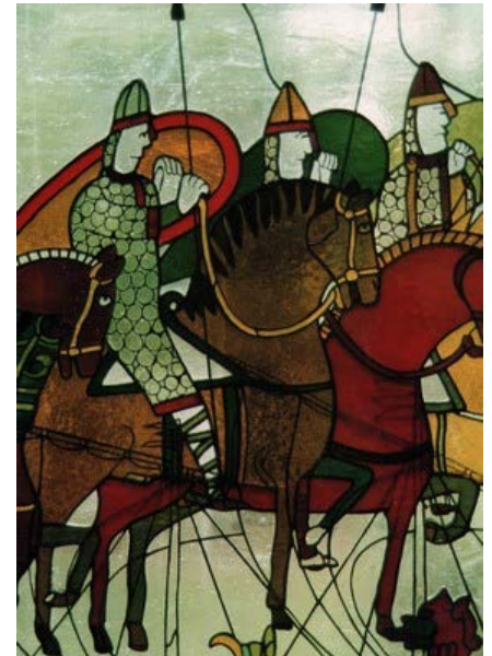
Figure 7: From Conquerors (1994) Robert Oddy.

We may sometimes wish to make lines appear indistinct in order to add a sense of distance. This can be done by plating a piece of opalescent glass in front of the layer containing the joins, or by painting lines on the reverse side of the glass. I have also found that finishing the solder with black patina makes lines less obtrusive. If there is any front lighting, plain solder will reflect some of it and the line will stand out.