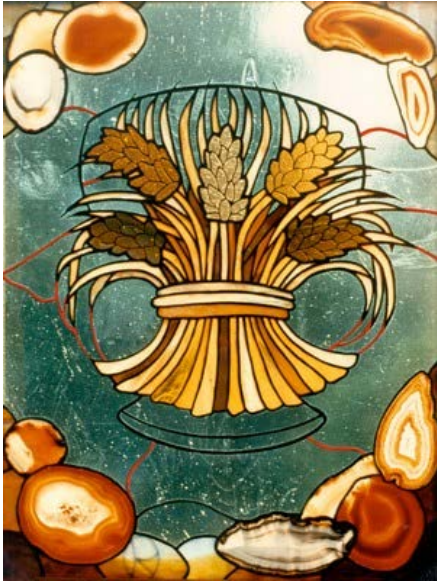
Figure 4: Friendship (1992) Robert Oddy. Technical lines are highlighted in red.

is that which is within the field of our senses, but is irrelevant to the meaning of the message. The message might be a picture, a song, or the road we are driving along. We filter out parts of the picture that we don't want or need to see. We are extremely good at this. The world is an incredibly complex place, and we would be utterly confused all the time if we could not ignore the noise. I think this explains why we usually overlook spurious lines in a stained glass panel—lines that the artist inserts for technical reasons to do with such things as cutting the glass or reinforcing the panel. I will call these "technical" lines. This is illustrated in Figure 4, where I have highlighted that panel's technical lines in red. As we interpret the picture, they have no meaning to us and we filter them out as noise.