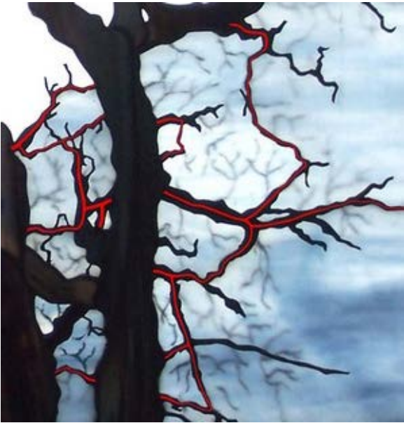
Figure 8: From Oak Tree (2008) Robert Oddy.

Joins were made with carved copper foil for branches.