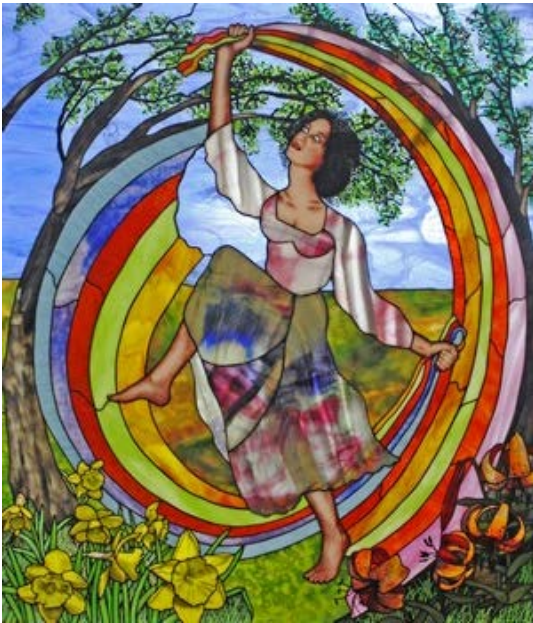
Figure 6: Liturgical Dancer (2011) Robert Oddy. Drapery glass used for the dress gives fold lines in a natural way.

one another. We have to know where one object ends and another begins. In order to do this, our minds “draw” lines around the objects as we identify them. We do this unconsciously. If we study the edge of an object consciously, as an edge, we see that there is no explicit line, but that’s not how we usually look at the world. This notion is consistent with what has been discovered about our visual system.