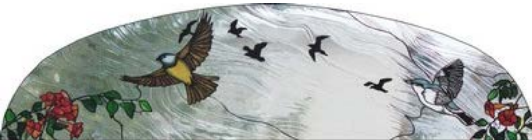
Figure 10: From Joan's Garden (2003) Robert Oddy. Joins follow the direction of the swirls in the sky.

Now let us talk about technical lines, that is extra join lines included for structural reasons. We should design these deliberately and artistically, so that the viewer is less aware of them. We should try to make them harmonious with the design. If a piece of glass surrounding a group of flowers or leaves, has to be divided into two or more pieces, make the join curve like a twig or branch. If a technical line is near an animal or a bird or a vehicle, it could be used to suggest motion. If it is in the sky, it might follow the texture in the glass to be consistent with clouds or wind (Figure 10).