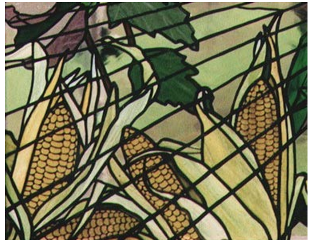
Figure 5: From Central New York (1989) Robert Oddy. Fine-line detail shows in the corn husks and kernels.