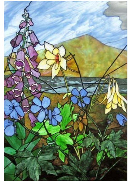
Figure 3: (Untitled, 2010), Robert Oddy. Flowers look delicate even with black outlines.

is that which is within the field of our senses, but is irrelevant to the meaning of the message. The message might be a picture, a song, or the road we are driving along. We filter out parts of the picture that we don't want or need to see. We are extremely good at this. The world is an incredibly complex place, and we would be utterly confused all the time if we could not ignore the noise. I think this explains why we usually overlook spurious lines in a stained glass panel—lines that the artist inserts for technical reasons to do with such things as cutting the glass or reinforcing the panel. I will call these "technical" lines. This is illustrated in Figure 4, where I have highlighted that panel's technical lines in red. As we interpret the picture, they have no meaning to us and we filter them out as noise.