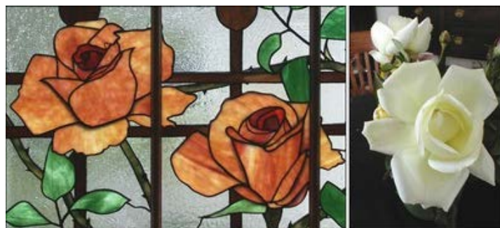
Figure 1: Stained glass roses have outlines, a real rose does not.

In representational art, lines often seem to get in the way. A blossom made with traditional stained glass techniques has black lines around the edges of each petal. A real blossom does not (Figure 1). Very few things in the real world have black outlines — neither natural nor artificial objects. What we see is not a line with thickness but a transition from one surface with its colors and texture to another with a different appearance behind it or in front of it. If we focus our eyes on an edge in the real world, the transition is sharp or sudden, but there is still no line, even a thin one. If the edge is out of focus, the transition is blurred or more gradual. It is still not a line, even a grey one. We might regard certain things in the real world as lines, such as cables and thin tree branches, but such a line is really a pair of transitions very close together. Sometimes, we perceive lines within the texture of things—the veins of a leaf, the crests of the ripples or waves on the surface of a body of water.