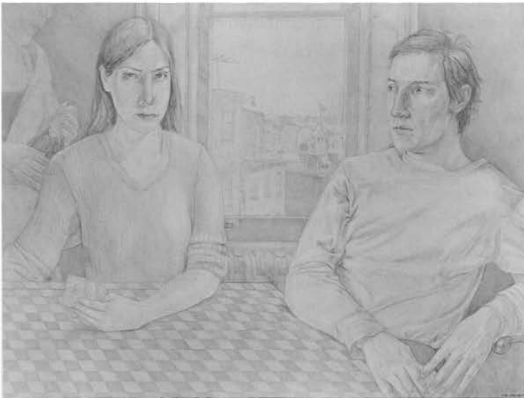
The Card Players Pencil on paper 20" x 30"