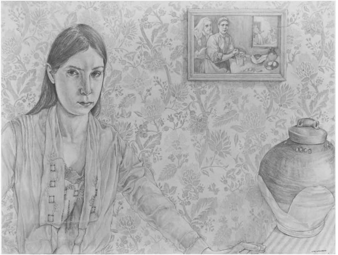
Self-portrait with Velasquez Pencil on paper 22" x 30"