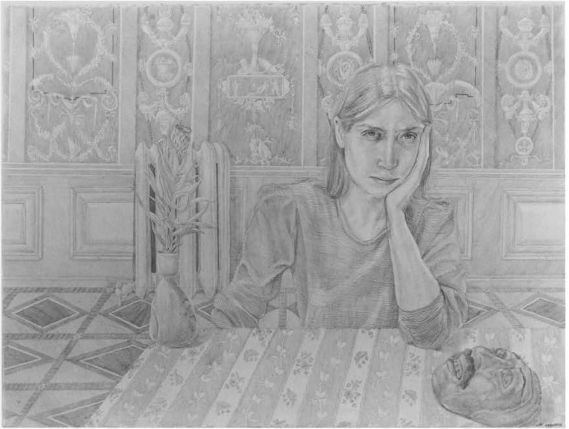
Self-portrait with Mask Pencil on paper 22" x 30"