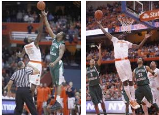
Syracuse beats Eastern Michigan 84-48. Check out the photo gallery on DailyOrange .