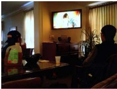
Students enjoying the movie 'Lorax'