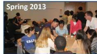
Spring 2013 Something on your mind ? Bring it to the circle!