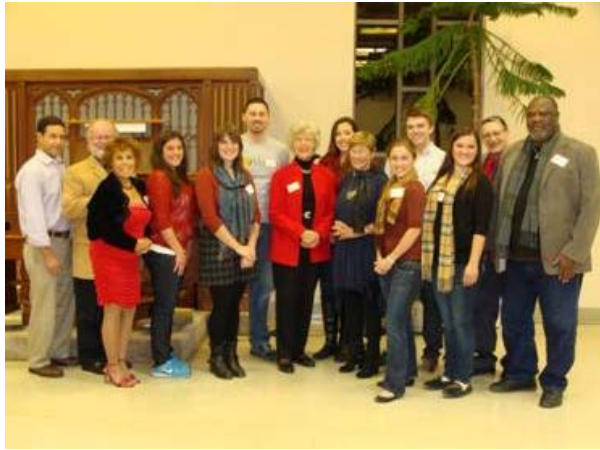
SCIS English Conversation Group leaders and students celebrate Holiday Party. Checkout photo gallery on Facebook .