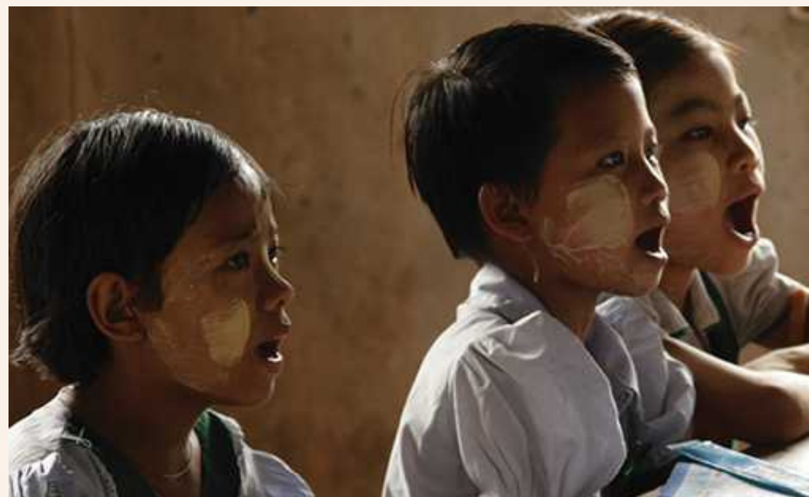
The students are learning in MLE class