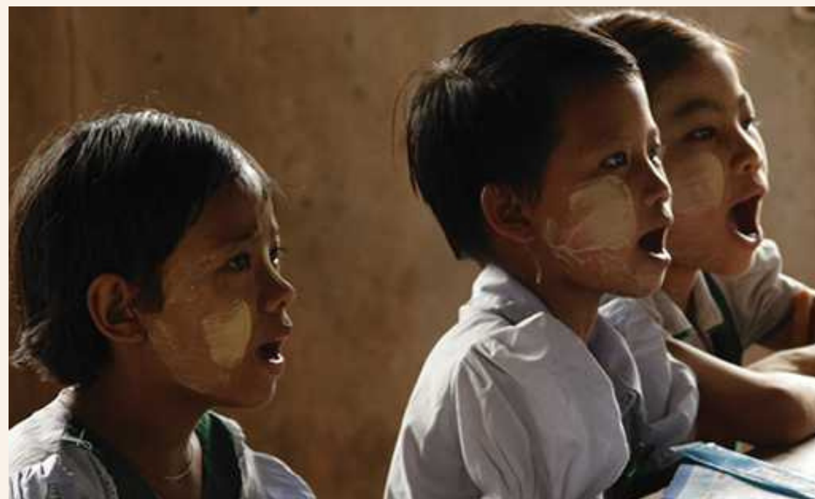
The students are learning in MLE class