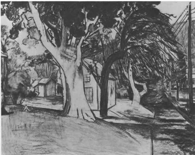
Main Street Contrasts— Walpack Center Charcoal on paper 37" x 47"