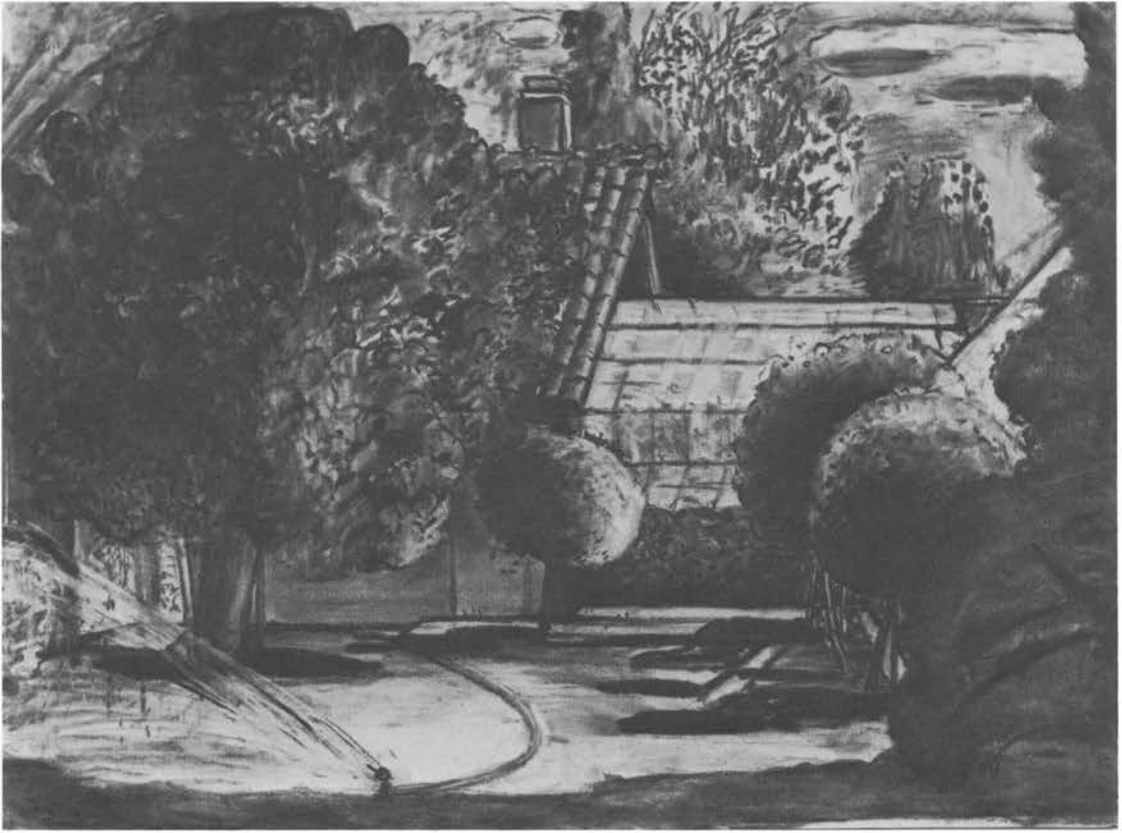
In the Garden Light Charcoal on paper 22" x 30"