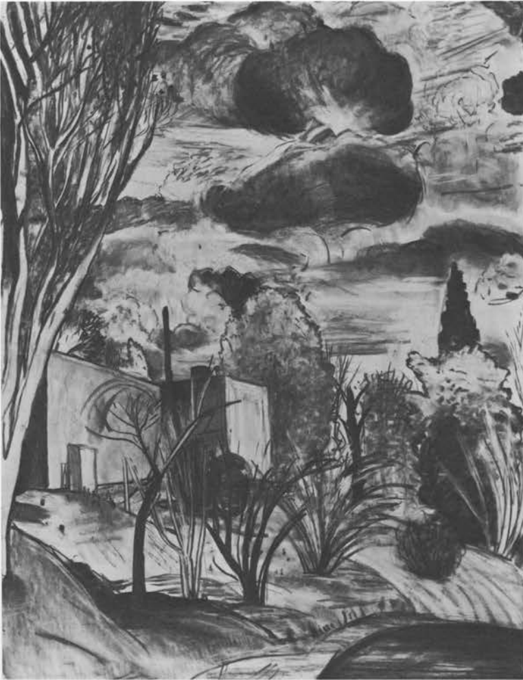
Gilcrease Sky Charcoal on paper 50" x 38"