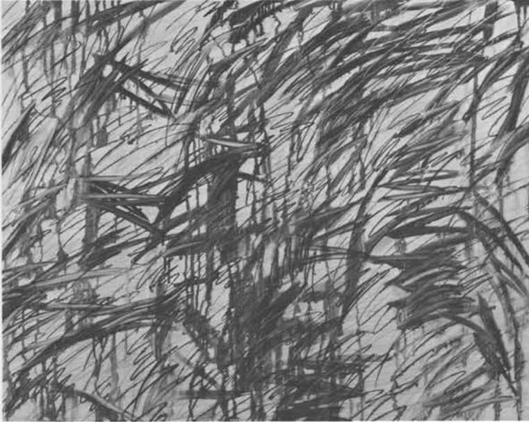
Untitled Paper with iridescent ground, powdered graphite, acrylic wash, various pencils 32" x 40"