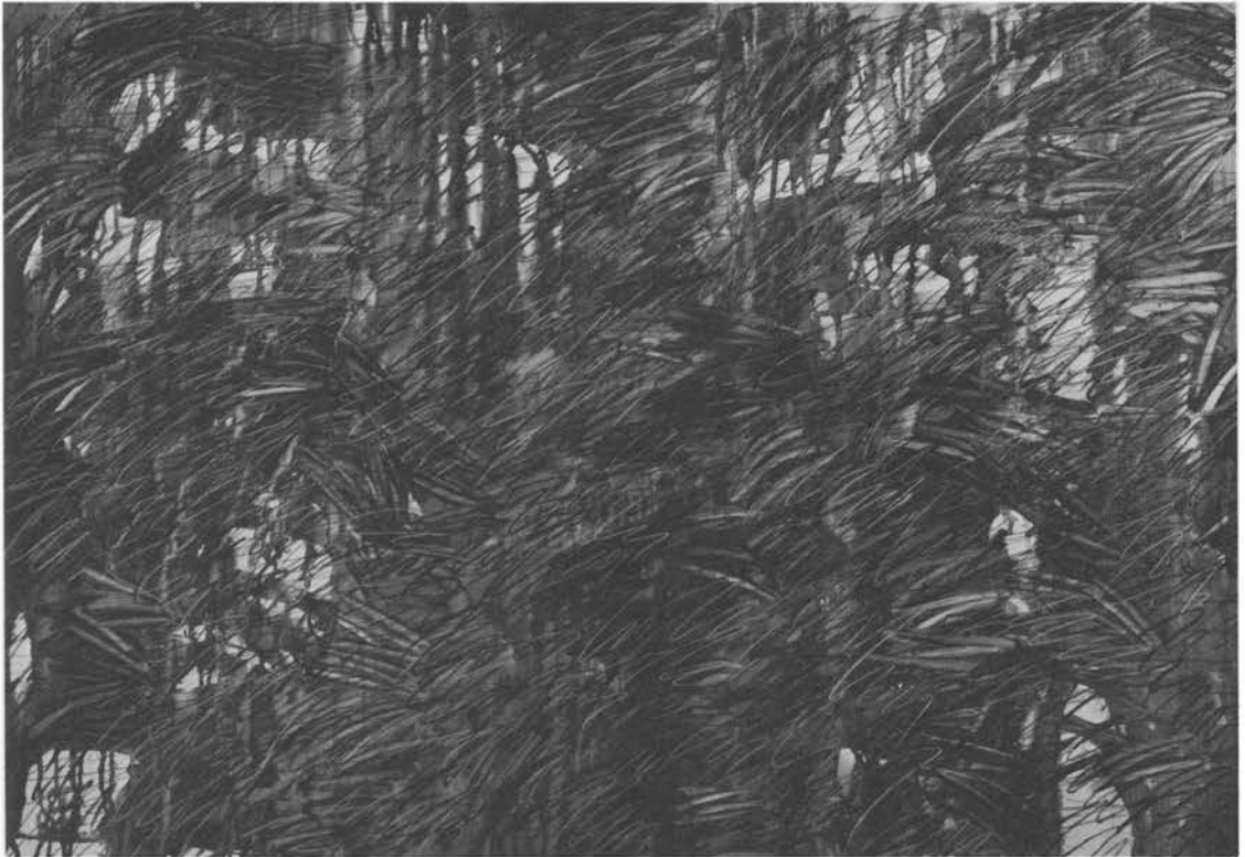
Untitled Paper with iridescent ground, powdered graphite, acrylic wash, various pencils 30 1/2" x 43"