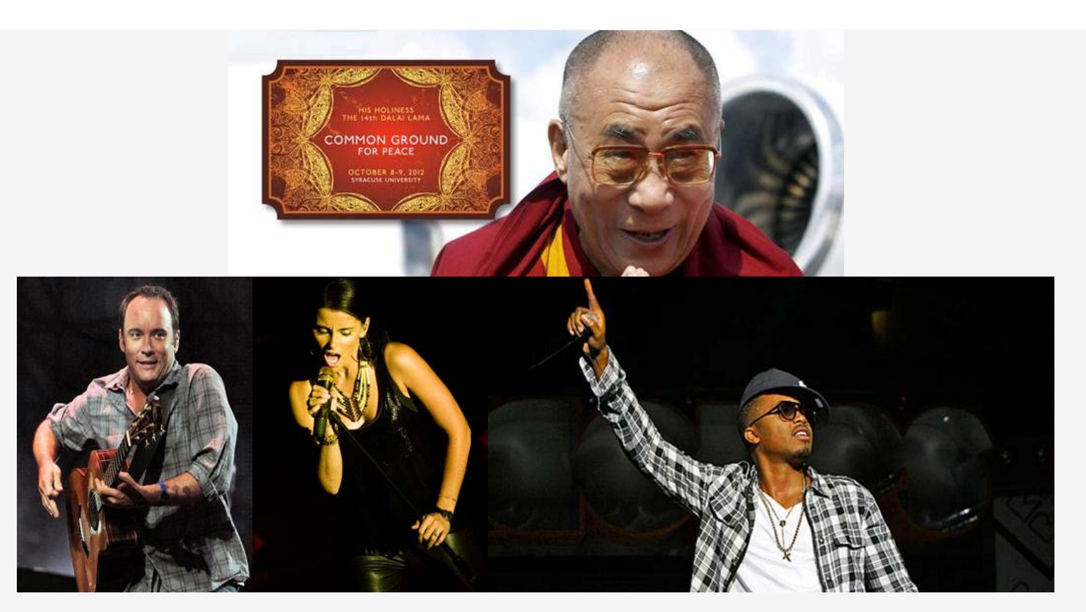
Read more about the One World Concert