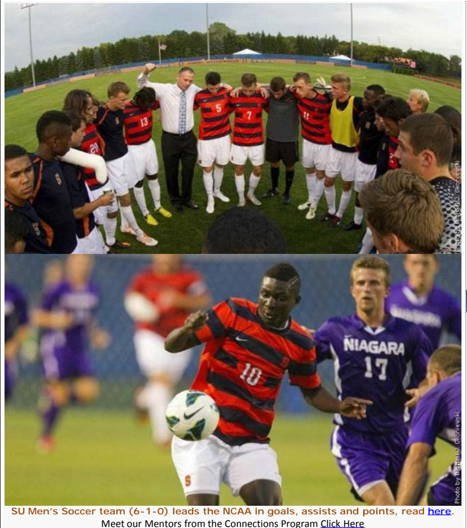
IN THIS ISSUE Syracuse University Slutzker Center News