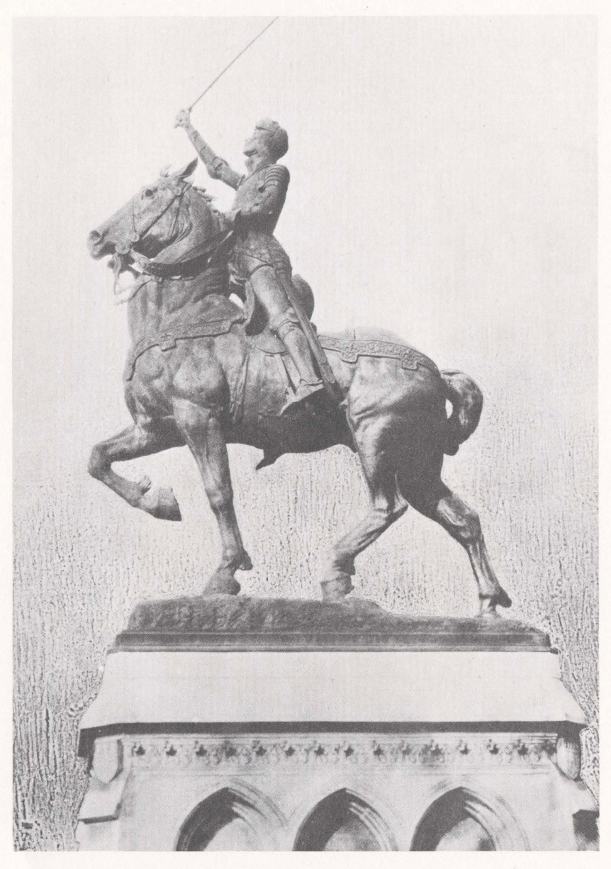
JOAN OF ARC Bronze, 1¼ times life. 1915. Riverside Drive and 93rd Street, New York, New York. Anna Hyatt Huntington, Sculptor