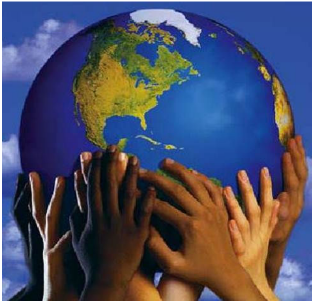
2011 International Education Week, November 14 - 18, 2011