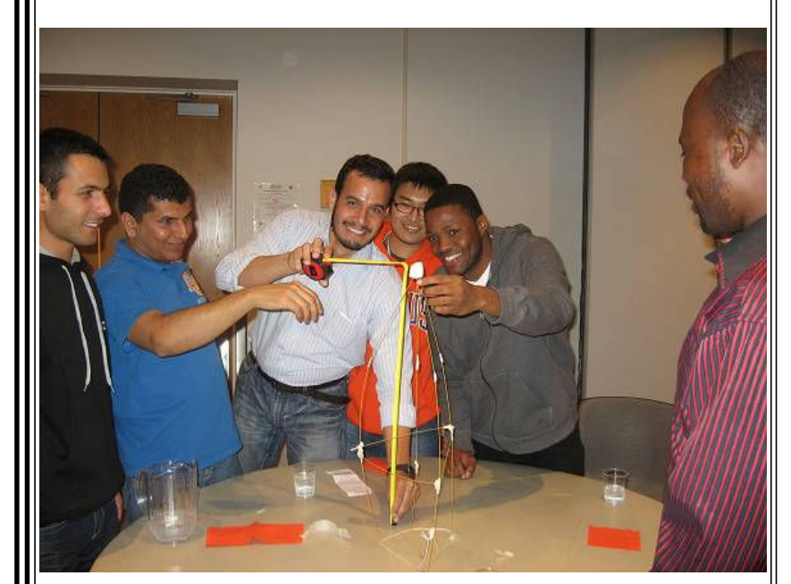
Mix-It-Up Event from Friday October 7th, 2011