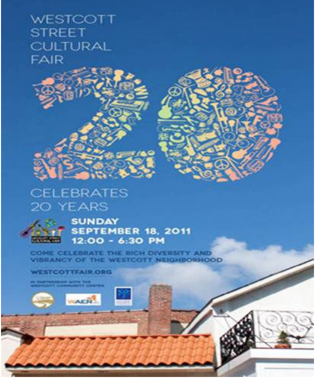
20th Annual Westcott Street Cultural Fair Sunday, September 18, 2011 www.westcottfair.org

The Westcott Street Cultural Fair (WSCF) is an annual, one-day celebration of the diversity and uniqueness of the Westcott neighborhood through its culture: visual and performing arts, food, service organizations and activities geared to families and Syracuse and LeMoyne students returning to the neighborhood. The fair attracts more than 8,000 people annually to the Westcott Business District in mid-September for a day filled with great sounds, sights, tastes and more.