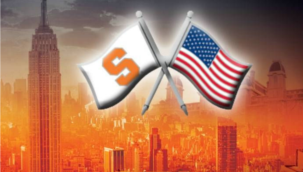
The first 5,000 fans in attendance will receive a commemorative pin displaying both the American flag and a flag featuring the Syracuse block "S" logo.

Syracuse football will honor the 10th anniversary of 9/11 on Patriotic Day at the Carrier Dome prior to the Orange squaring off against Rhode Island on Saturday at 4:30 p.m. (TWCS/SNY, BIG EAST Network).