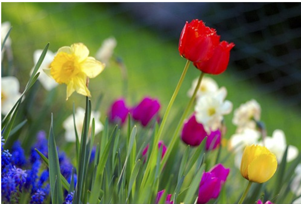
Beautiful spring in Syracuse, NY

Syracuse University Friday, April 09, 2010