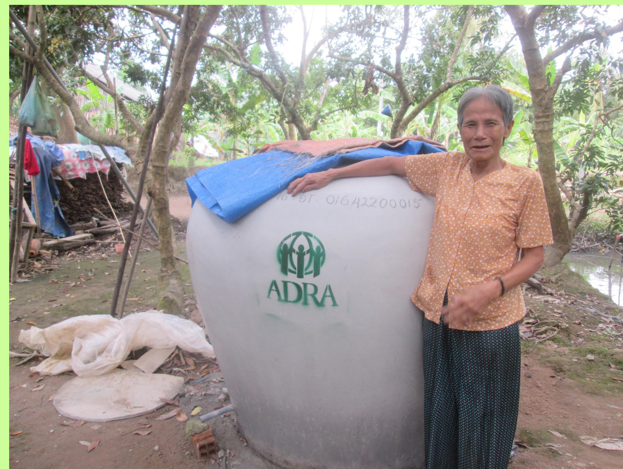
A beneficiary received a water jar to prepare for draught and saltwater intrusion in Mekong Delta, Vietnam.