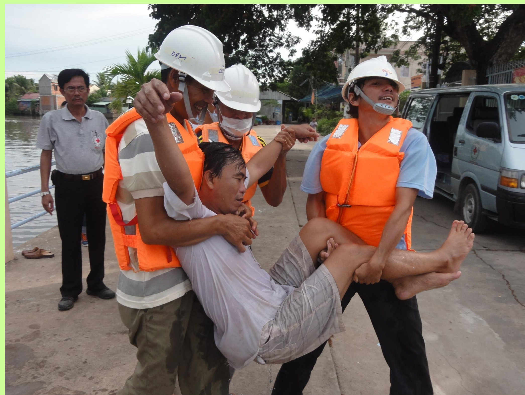
First aid training . Source: ADRA in Vietnam