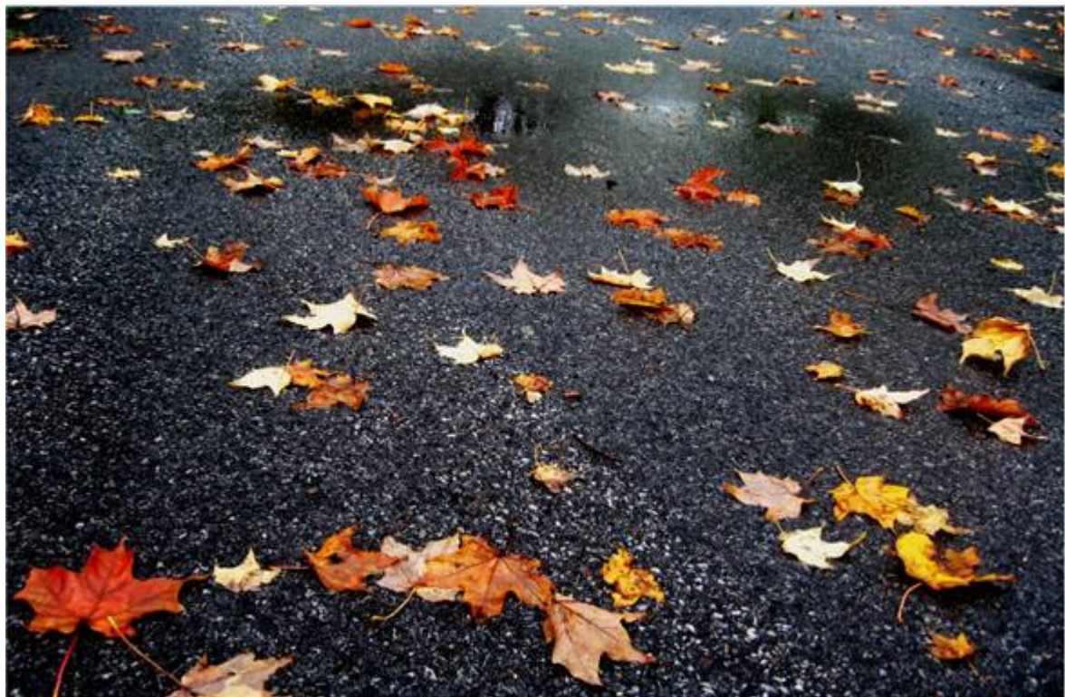
By Nitin Mule Westminster Park - Euclid Avenue