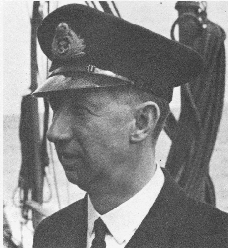
Lt. Cdr. Nevil Shute Norway RNVR. Courtesy of Heather Norway Mayfield.

11. A Town Like Alice : 206 page typescript, dated March 27, 1949 on page 1 and July 6, 1949 on page 205, with numerous author's holograph additions and corrections. Accompanied by 17 page manuscript of author's notes on titles, plot development, characterization and setting.