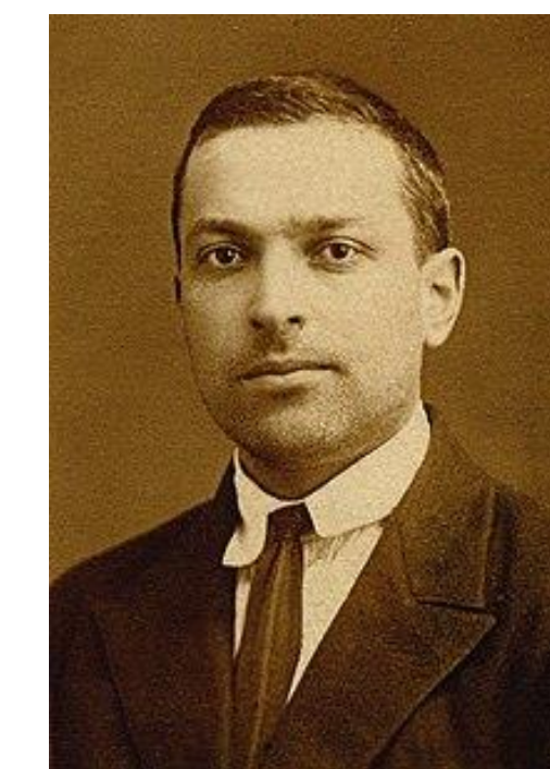
Lev Vygotsky Cherry, K. (2020)