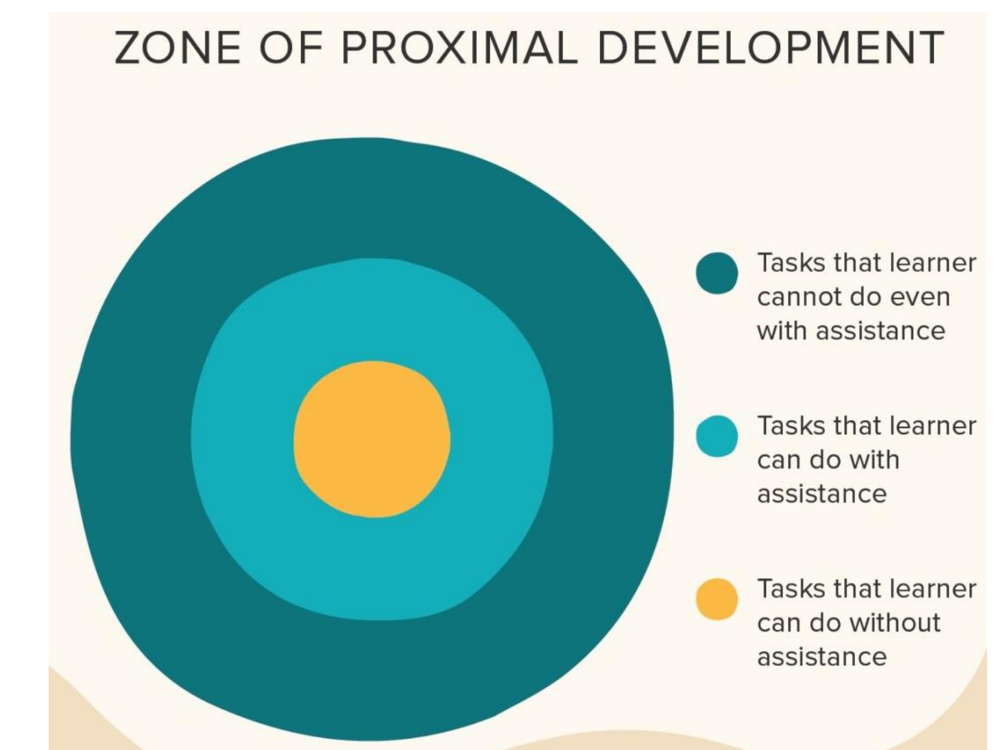
Yetman, D. (2020)