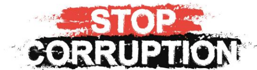
Figure 2. "Stop corruption paint grunge sign vector image" Created by VectorStock