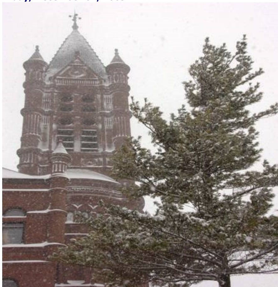
SU Photo & Imaging Center