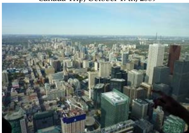
View of Toronto from the CN Tower