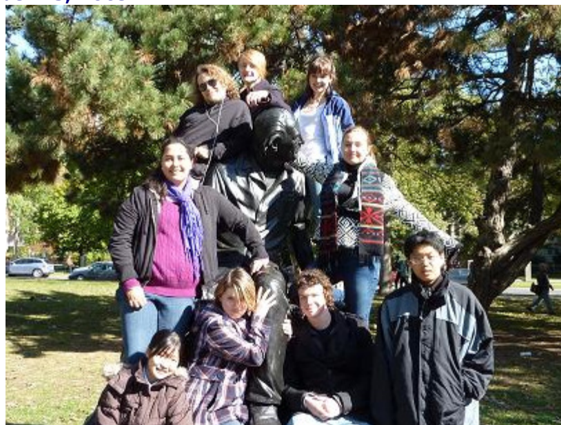
Canada Trip, October 17th, 2009