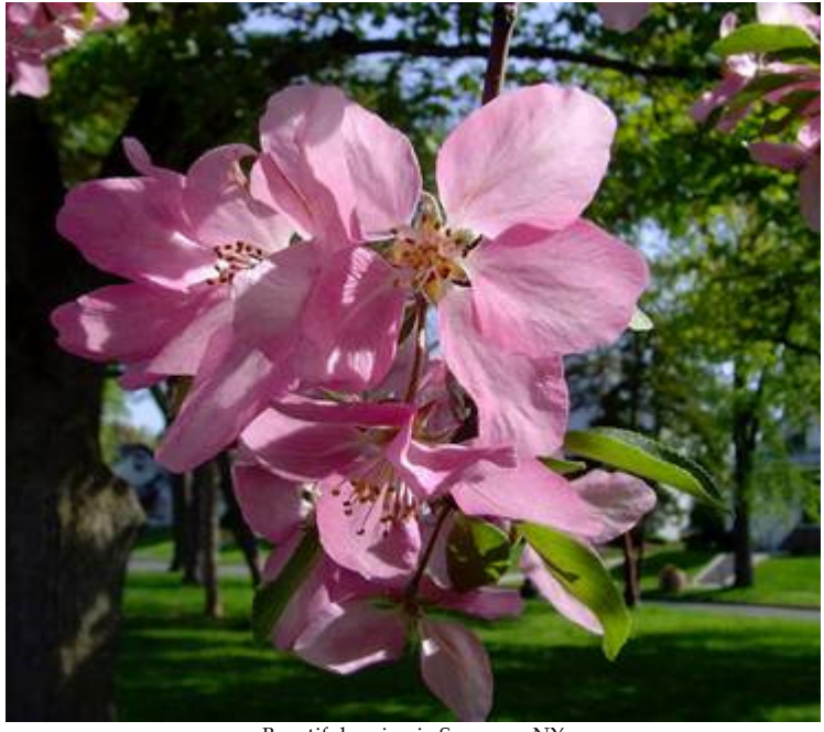
Beautiful spring in Syracuse, NY